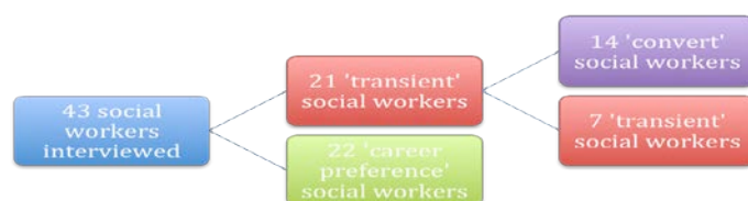
Figure 1: Career decisions and retention in child protection and welfare