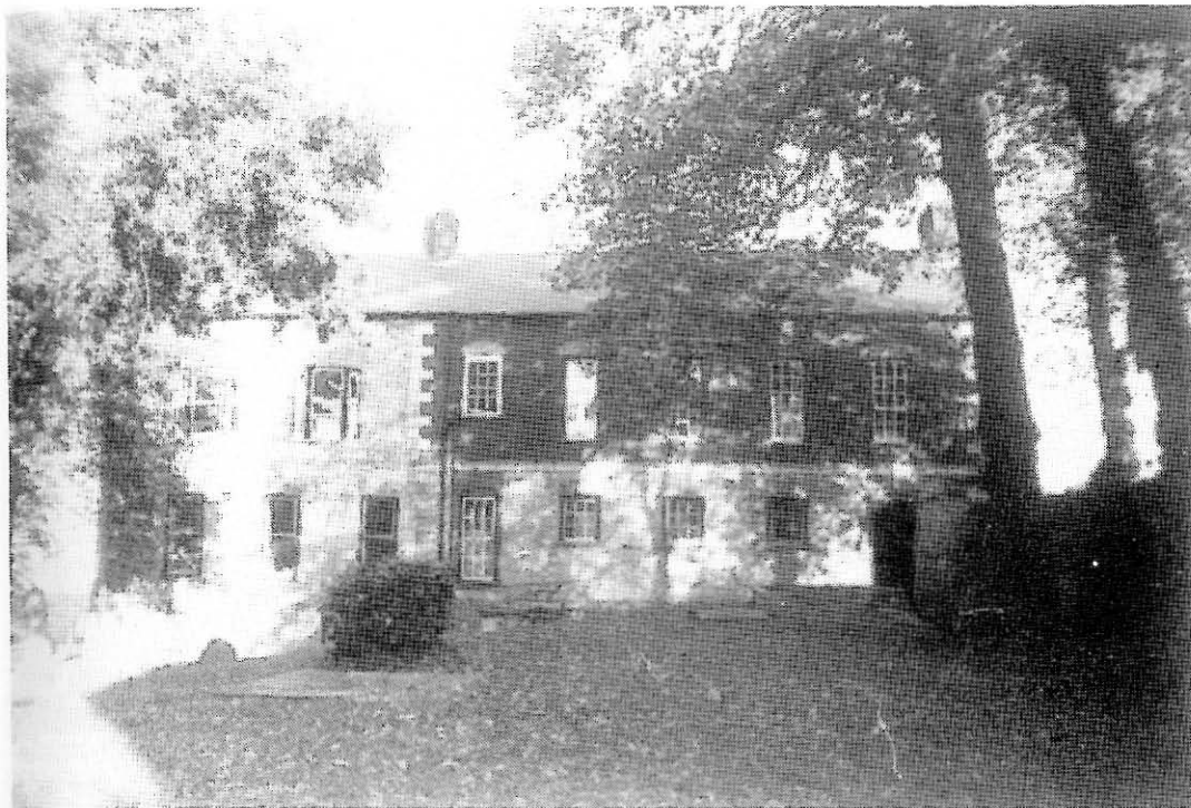
OLD LIBRARY, AT ST FIN BARRE'S