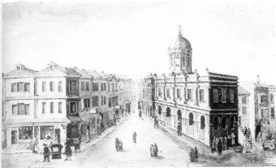
'The Exchange and Castle St., Cork'. A conjectural drawing by John Fitzgerald, said to be based on an early 19th-century illustration.