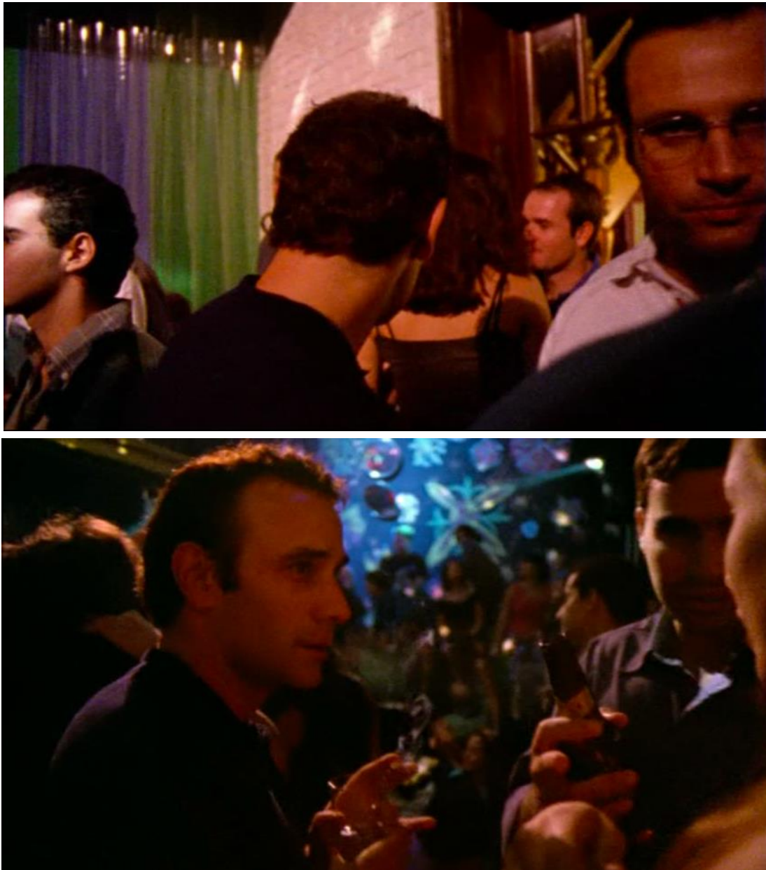
Figures 1 and 2: While Ivan walks through the crowded nightclub, a few club goers are aware of the camera’s presence. O invasor ( The Trespasser , Beto Brant, 2001). Drama Filmes, 2001. Screenshots.

shooting in close proximity and “on-the-fly”. However, the crowd’s intermittent gaze toward the camera helps stimulate a shift to the documentary mode (Figures 1 and 2).