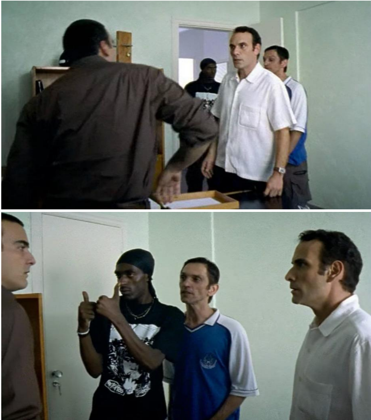
Figures 5 and 6: The “blocking and revealing” schema. O invasor . Drama Filmes. Screenshots.

When Sabotage starts rapping, his physical gestures shift from choreographed motions to a more spontaneous hip-hop performance. Although fictional, it seems disconnected from fiction and is imbued with the music’s rhythm. That is precisely Brant’s intention; for him, Sabotage’s personality and actions in the film oscillate from fiction to an actual music performance register. This is evident in the character’s exaggerated gestures and the slum slang he employs that add humour and authenticity to the scene, while Sabotage’s disregard for the basic rules of acting (with his furtive glances toward the camera) may spoil the filmmaker’s fictional intentions (Figures 7 and 8).