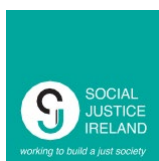
Social Justice Ireland