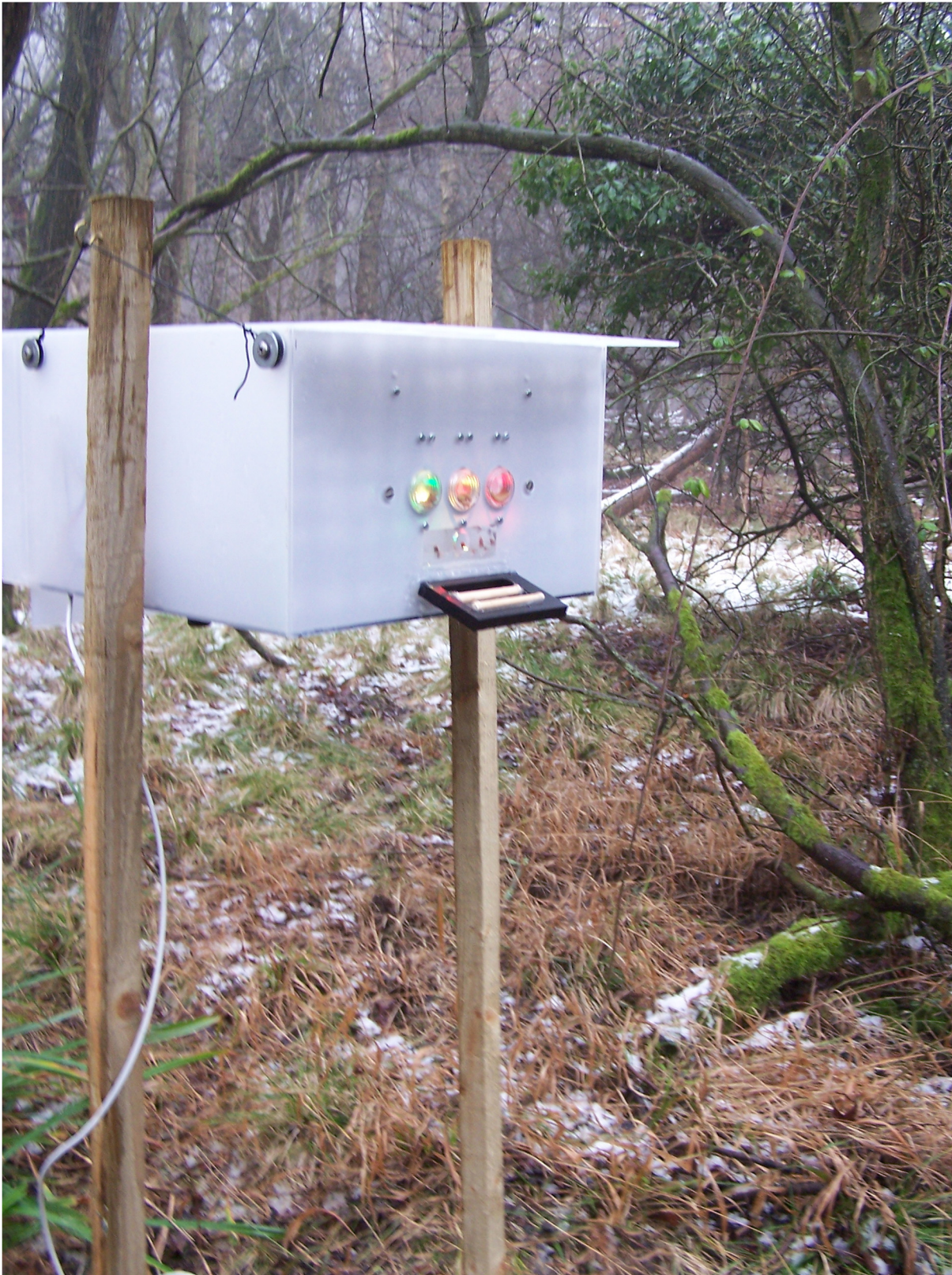
Fig 1. One of the portable operant devices installed in Wytham Woods, Oxford, UK. The weatherproof external casing is made of opaque Perspex, while the three response keys and the section of the front panel comprising the feeding hole are transparent. The perch (bottom of the front panel) is equipped with an antenna that relays information about the unique PIT-tag combination of marked individuals to the printed circuit board located within the device.