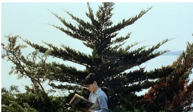
Figure 3: Boy reading in a tree. Mon oncle d'Amérique . New Yorker Video, 2000. Screenshot.

As we learn from his 1952 essay “In Defense of Mixed Cinema”, originally published in a Swiss anthology, André Bazin never associated the cinema with aesthetic purity. In fact, Bazin’s impurity stands for a nonhierarchical, antibinary dialogue with the other arts. This dialogue is evolutionary and nonlinear, because it can include new twigs, dead roots, detours, reversals, missing links and even the special case of the Hollywood “remake” as anti-evolutionary repetition. 6 Furthermore, for Bazin, the encounter between cinema and the arts is more intricate and surprising than the two paradigms which are relevant to twentieth-century modernity. These two models are: Richard Wagner’s primitive fusion and loss of self through the gesamtkunstwerk , and G. E. Lessing’s emphasis on isolation among the arts in his Laocoön (1776). 7 The concept of “specificity” comes from this second, foundational text. Lessing argues that poetry and painting must remain separate and self-referential in order to fulfil their respective vocations. Both approaches are clearly incompatible with the dual and anti-anthropocentric nature of photography. Lessing is all about artistic self-centredness while Wagner glorifies an irrational, primitive Other at the expense of critical self-consciousness.