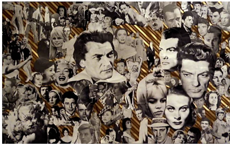
Figure 4: Janine's poster in Mon oncle d'Amérique . New Yorker Video, 2000. Screenshot.

through Marilyn Monroe and Humphrey Bogart in Cahiers du cinéma . Needless to say, Janine's poster is all about Bazin and Resnais's generation.