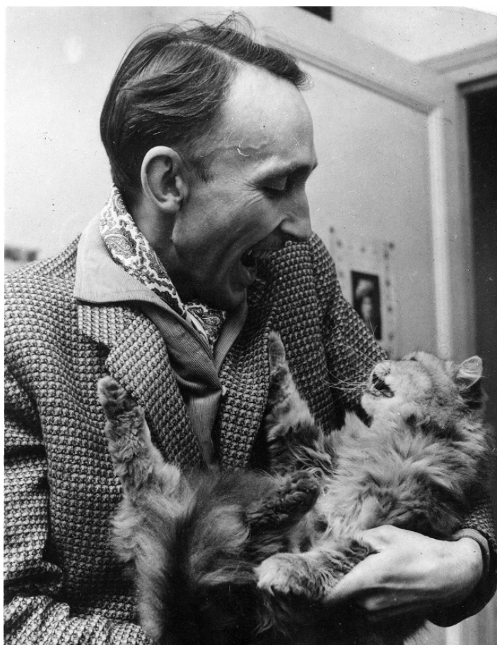
Figure 1: André Bazin.

Luchino Visconti, and Federico Fellini approximated Bazin's search for a perceptual realism of reciprocity, one based on the bidirectionality of sight. While the revelations of the real are unpredictable, Bazin disliked the concept of the supernatural. He was much more intrigued by the way in which the Surrealist taste for the uncanny might drive a wedge between the opacity of daily life and the mystery of the cosmos.