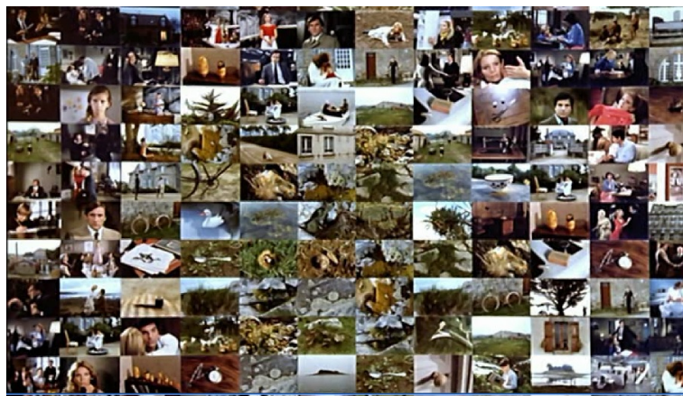
Figure 5: Collage of film images. Mon oncle d'Amérique . New Yorker Video, 2000. Screenshot.

In addition to the final deceiving trompe l'œil and Janine's devotional poster halfway through Mon oncle d'Amérique , at the very beginning of his film, Resnais offers a gridlike collage of 140 small, randomly arranged photographs—all of them originating in the footage from which he will edit his film. This incoherent, nonlinear grid of landscapes, people, objects, animals and plants collides with Sonfist's orderly trompe l'œil . Without a doubt, Resnais's photographic collage does stand for the amorphous Real that we cannot grasp, namely for a range of open possibilities that has not yet settled into a subjective experience. Different areas of Resnais's messy grid of still shots fall in and out of darkness. Possibly a metaphor for cinema itself in relation to our limited perception of the world, a cone-shaped flashlight illuminates one area, but it can do so only for a brief while. Inevitably, its subsequent move away darkens a whole region of this chaotic display, while another area will come to the fore and to our attention, thanks to the moving light.