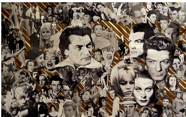
Figure 4: Janine's poster in Mon oncle d'Amérique . New Yorker Video, 2000. Screenshot.

through Marilyn Monroe and Humphrey Bogart in Cahiers du cinéma . Needless to say, Janine's poster is all about Bazin and Resnais's generation.