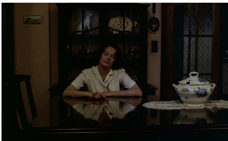
Figure 2: Jeanne Dielman, 23 Quai du Commerce, 1080 Bruxelles (Chantal Akerman, 1975). Criterion Collection, 2009. Screenshot.

Subsequent to her two installations (The masterwork, D'Est, au bord de la fiction , 1995, and Self-Portrait/Autobiography: A Work in Progress , 1988), 4 and prior to participating at Documenta ( From the Other Side , 2002), in her Woman Sitting Down After Killing (2001) in Venice, Chantal Akerman used six monitors to show the seven-minute sequence in which the heroine of her film Jeanne Dielman, 23 Quai du Commerce 1080 Bruxelles (1975) sits in her dining room after killing one of her occasional male clients, experiencing the passage of time. The small amount of movement that remains in the image from the original film is captured and increased by the installation through a series of almost imperceptible increments.