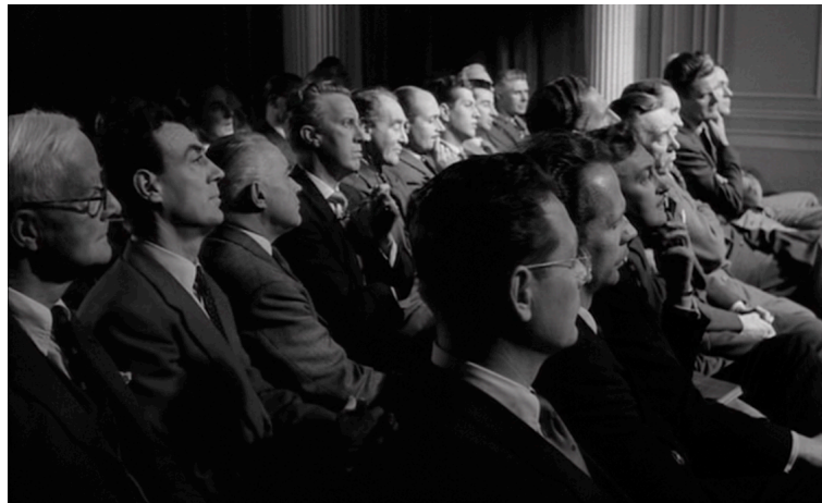
Figure 5: Night of the Demon (Jacques Tourneur, 1957). Mediumrare, 2010. Screenshot.

[Projection: Public hypnosis and auto-defenestration scene, 7']