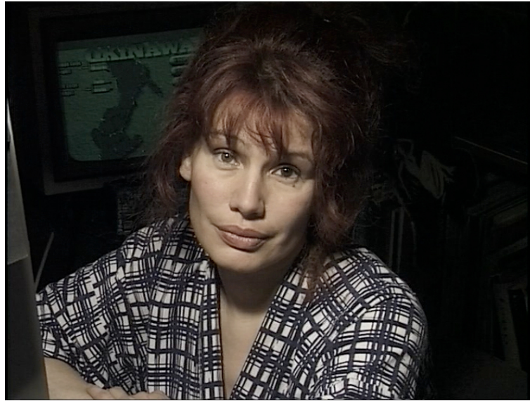
Figure 7: Level Five (Chris Marker, 1997). Optimum Home Entertainment, 2011. Screenshot.