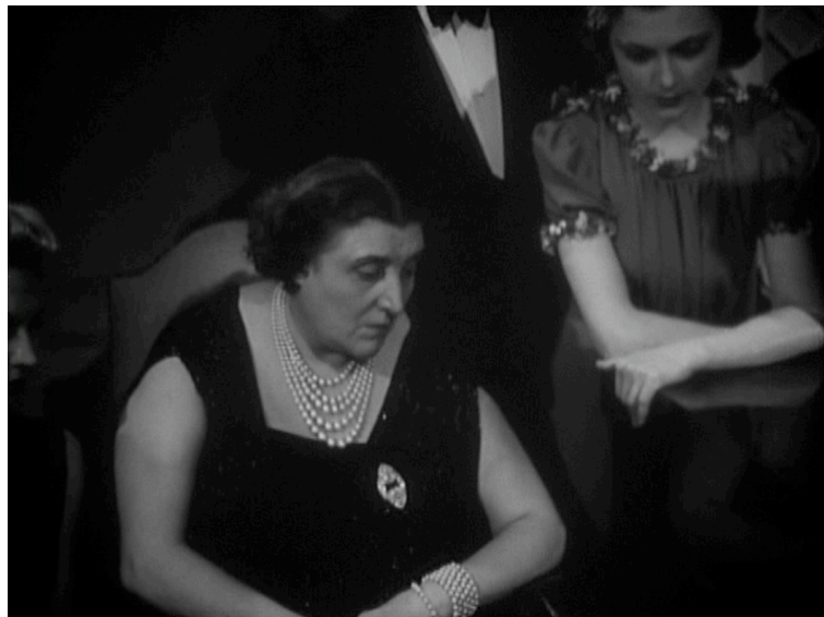
Figures 3 and 4: La Règle du jeu . (Jean Renoir, 1939). BFI, 2003. Screenshots.

Firstly, I want to recall the contrast developed in an installation by Stan Douglas called Pursuit, Fear, Catastrophe: Ruskin B.C. (1993), in which, to the side of a screen on which an early film was shown, the artist placed a mechanical piano that played a single excerpt from Schoenberg. I will ignore the possible connotations that could be attached to this choice of music to focus instead on the piano to the side of the screen, which is so emblematic of silent film. 12 Perhaps Douglas also envisioned it as an inverted echo of Renoir's magnificent gesture in which he identifies the excellence of "cinema, alone" using the image of a piano that suddenly becomes automated, in which the sound becomes incorporated in the very fabric of the image. One will observe that the piano is first played normally, to accompany the pantomime as in the very early days of cinema, it then plays alone under the horrified gaze of the pianist played, appropriately, by Mary Meerson) and that, in tandem with the camera, the music forms a commentary on the actions and emotional responses of the characters.