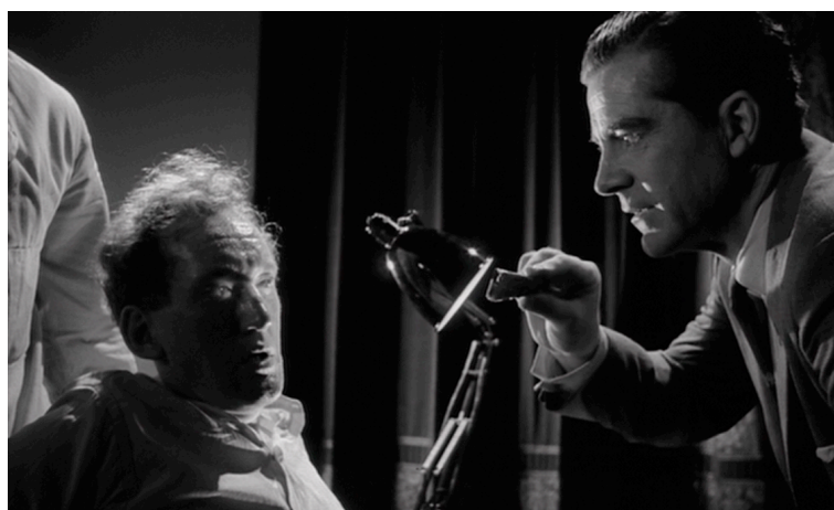
Figure 6: Night of the Demon (Jacques Tourneur, 1957). Mediumrare, 2010. Screenshot.