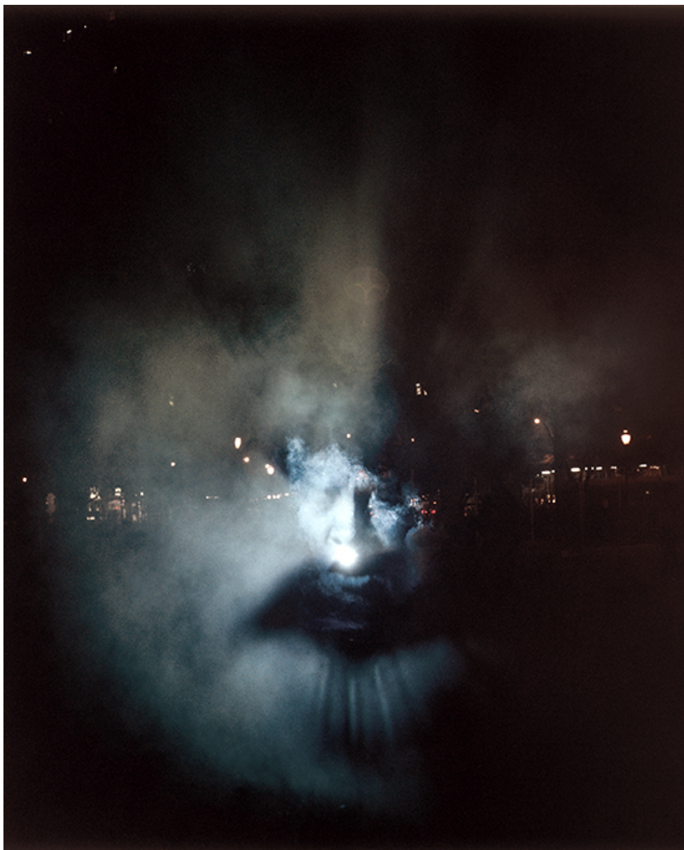
Figure 1: Tony Oursler, The Influence Machine , 2000–2002. Video projections. Madison Square Park, New York / Soho Square, London / Magasin 3, Stockholm.

Raymond Bellour, Director of Research Emeritus at C.N.R.S., Paris