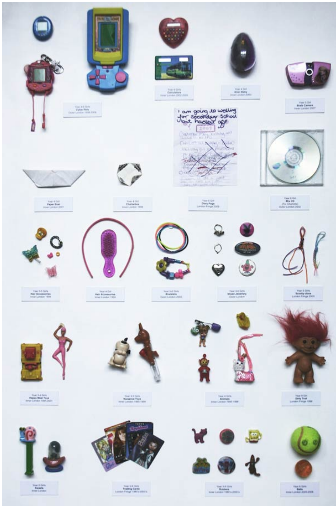
Figure 1: Confiscation Cabinets . By Guy Tarrant. Museum of Childhood, London (9 November 2013 – 1 June 2014).