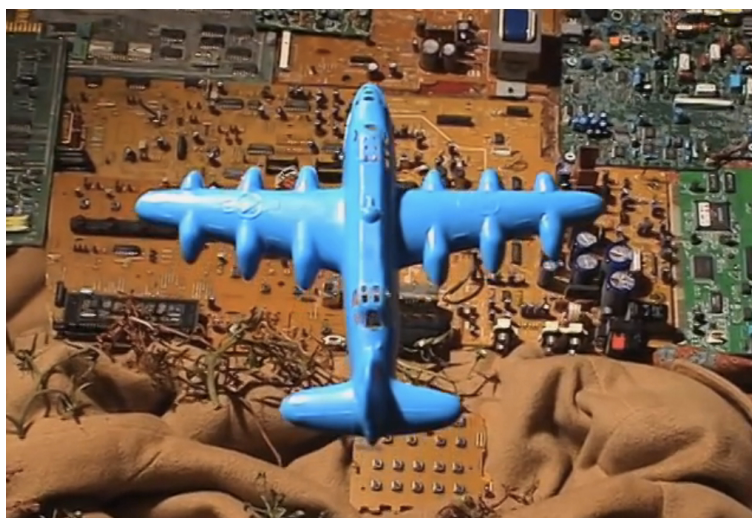
Figure 2: KaBoom! (Adam Pesapane, 2004). Screenshot.