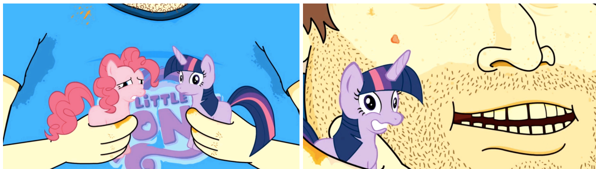
Figures 3 and 4: Pinky Pie and Twilight Sparkle find themselves captives of a stereotypical, Cheeto-eating Brony (left); and Twilight Sparkle is the unwilling object of adult Brony affection (and unkempt stubble) (right) in the Funny Or Die parody “My Little Brony: Friendship is Tragic”. CollegeHumor , 2012. Screenshots.

And, indeed, one recurring concern that the Brony fandom constantly polices is the potential for eroticisation of children’s toys, children’s programming and, by extension, children themselves. Images of MLP:FiM blow-up dolls and plushies—some of them made by Bronies themselves as part of the creativity licensed and encouraged by this “participatory” fandom (Jenkins)—met with anxiety when publicised on the Internet. Bronies engage in a wide range of prosumer practices as they create familiar outputs such as fan fiction, artwork, music and laser light shows at Bronycon and also go farther, to “rework biblical narratives using characters and images from MLP: FiM ” (Crome 400). Bronies, like many fan communities in convergent media culture take seriously the promise of fandom as a “permanent outlet for their creative expression” (Jenkins 42).