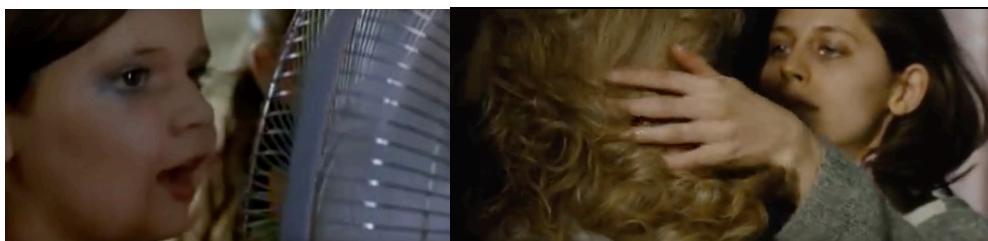
Figures 1 and 2: Haptic visuality: children's voices are made strange by the movement of an electric fan in The Swamp , Lita Stantic Productions, 2001 (left); the camera isolates hands moving through hair in The Headless Woman , El Deseo, 2008 (right). Screenshots.