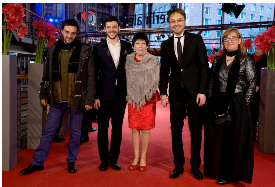
Figure 3: Luminița Gheorghiu on the 2013 Berlin Festival red carpet.

The q and a session after the first Romanian public screening of Child's Pose at the annual Transylvania International Film Festival in Cluj-Napoca in June 2013, following the film's Golden Bear Berlin prize, was a similarly disappointing event. Those members of the audience who asked the actor questions did not seem to treat her as a Bette-Davis figure, rather they approached Gheorghiu as a kind of well-loved neighbour. One question in particular characterised this attitude: did Luminița Gheorghiu, as a mother, think we should help our adult children like Cornelia does in Child's Pose , or should we not get involved in their lives? This actress whom I admired and from whose various mediatised faces I had formed a star image of my own at that moment was addressed as just an ordinary person, who is a parent, who has children, or who is a child. This seemed to be a lowest common denominator point, resulting in the deposition of Luminița Gheorghiu from the red carpet into the mildly dusty interiors of an average Romanian cinema.