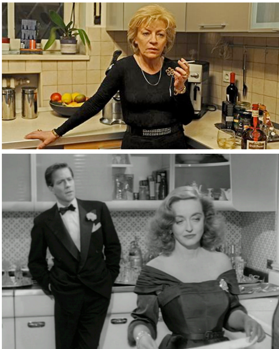
Figure 1 (above): Luminița Gheorghiu as the mother in Child’s Pose (Călin Peter Netzer, 2013). Parada Film, 2013. Figure 2 (below): Bette Davis as Margo Channing in All about Eve (Joseph L. Mankiewicz, 1950). Fox, 2012. Screenshots.

Child’s Pose ’s publicity stills were made public before the film’s national premiere, as a result of the movie’s well-organised Facebook campaign, created for its screening at the 2013 Berlin Film Festival. This material highlighted the figure of Gheorghiu and her complex, naturalistic, powerful performance as the mother. A still from the film (Figure 1), which was widely publicised, recalls actor Bette Davis in the role of Margo Channing in All about Eve (Joseph L. Mankiewicz, 1950) (Figure 2).