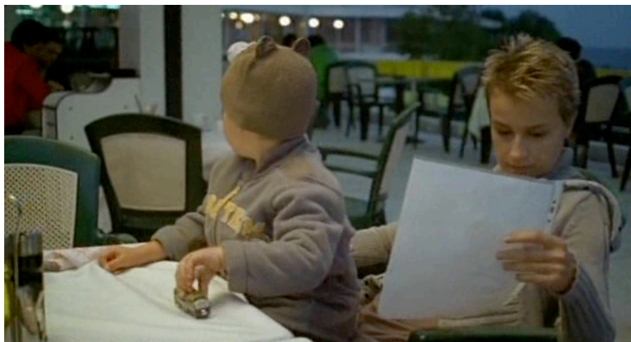
Figure 6: Anamaria Marinca as Smaranda (with her son) in Summer Holiday (Radu Muntean, 2008). Voodoo Films, 2010. Screenshot.

While this is not meant to be an exhaustive study of the phenomenon of unglamouring female cinema stardom in the context of the Romanian New Wave, I also wish to mention perhaps the best known example of this kind: the actor Anamaria Marinca, EFP Shooting Star at the 2008 Berlinale. Marinca plays the role of Otilia in Mungiu's 4 months, 3 weeks and 2 days , giving an acclaimed, multiple-award-winning performance in a film with a prestigious Cannes trophy. The role leaves little room for narcissistic mirroring and glamour: Otilia is a young engineering student in 1987 communist Romania who undergoes deeply traumatic experiences. Marinca's minimalist acting style, understated manner of speech and carefully precise, economical mode of movement through space re-emerges in another marital melodrama by Radu Muntean, Summer Holiday . Here Marinca plays Smaranda, a young mother pregnant for the second time, who is humiliated by, but still needs to comply with her husband's childish rush of panic as he approaches middle age.