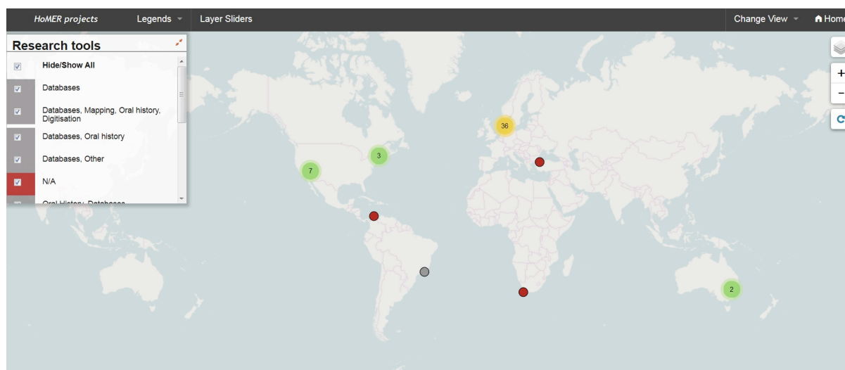
Figure 2: HoMER Projects website ( homernetwork.org/dhp-projects/homer-projects-2 ). Screenshot.

Although research using quantitative data could be considered as more apt to comparison because of the availability of numerical data and statistical software, quite similar methodological pitfalls and challenges in terms of interoperability and incompatibility occur. In an ideal scenario with lots of quantitative data on issues like the number of cinemas, seats or box-office revenues, clear decisions are to be made at different stages of the research here as well (cf. defining hypotheses, conceptual framework, time/spatial frames, selection of