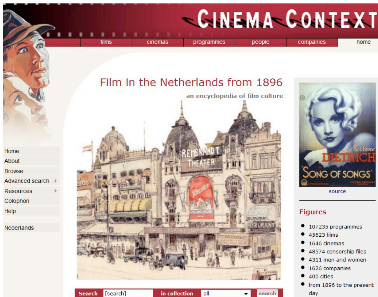
Figure 3. Opening web page of the Dutch Cinema Context project (www.cinemacontext.nl). Screenshot.

some of this work operationalised a comparison with other countries like Belgium (e.g. Convents and Dibbets) or the UK (Sedgwick, Pafort-Overduin, and Boter), Dutch film historians had a very fertile discussion on trends, factors and conditions explaining the particularities of their national cinema history (e.g. Dibbets, “Het taboe”; Pafort-Overduin, Sedgwick, and Boter; Thissen; Van Oort). The dialogic nature of Dutch historical cinema studies is interesting, not only for understanding what happened in the Netherlands. It also underlines how both cinematic and non-cinema-related conditions were important in order to grasp the larger dynamics within the Dutch film culture. Among the noncinematic conditions we find arguments on the influence of Calvinism and its view upon visual culture and cinema, the vertical stratification of Dutch society, or class, explaining how cinema had difficulties to attract middle- and upper-class audiences. Besides this mixture of religious, ideological and other societal conditions, issues related to the film industry itself were examined. Hypotheses were raised as to the impact of the severe national censorship system, heavy municipal entertainment taxes, and to the policy of the Dutch film exhibitors’ association to restrict the number of cinema operations in the country (Sedgwick et al.; Thissen; Van Oort).