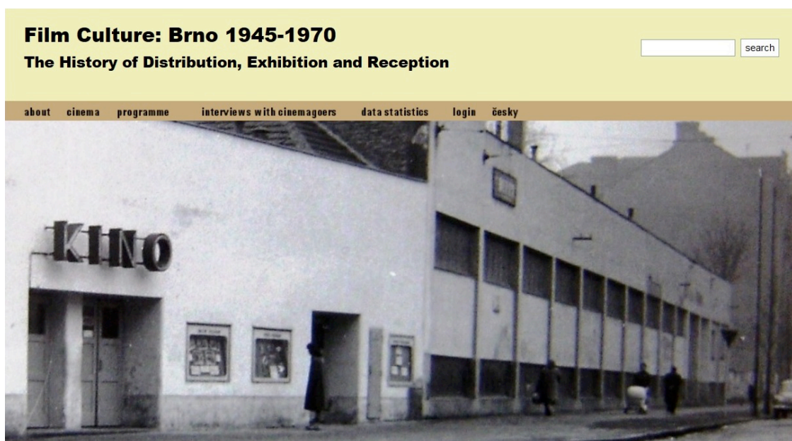
Figure 1: Home page of the Czech Film Culture in Brno (1945–1970) project ( www.phil.muni.cz/dedur ). Screenshot.

A similar diagnosis on geographical monocentrism can be made for other directions within the new cinema history perspective. This is for instance the case of studies that try to capture audience's film reception by using sources like cinemagoing statistics and box-office and admission figures (e.g. Harper, on the Regent Cinema in Portsmouth; Jurca and Sedgwick, on Philadelphia), or those relying on programming patterns as an index for audience's choice and film popularity (e.g. Sedgwick, "Patterns", on Sydney; Treveri Gennari and Sedgwick, on Rome). Also the growing work on film venues and exhibition structures often focuses upon single case studies, mostly within the confines of one country, region, city or neighbourhood (see examples in Maltby, Biltereyst, and Meers; Biltereyst, Maltby, and Meers).