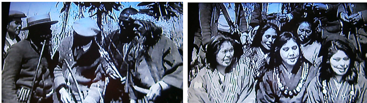
Figures 1 and 2: To the Sunny East (Prod. Nippon Yusen Kaisha, 1926). Screenshots.

Since the 1970s, the profound epistemological crisis that took place in the field of Visual Anthropology helped us to understand that ethnographic film is essentially an