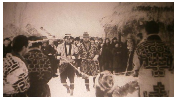
Figures 13 and 14: The Ainu Bear Festival / Divine Dispatch ( Iyomande. Kuma okuri , Neil Gordon Munro 1931). Screenshots.