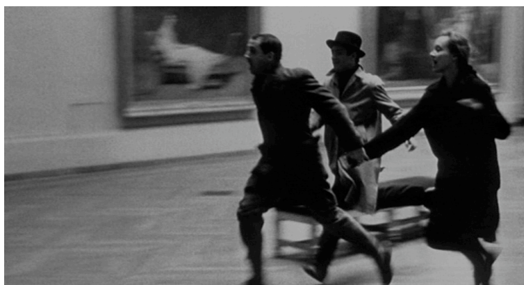
“The run through the Louvre”: Stills from the sequence in The Dreamers in which extracts from Jean-Luc Godard’s Bande à part are intercut with Bertolucci’s colour replication of the original.