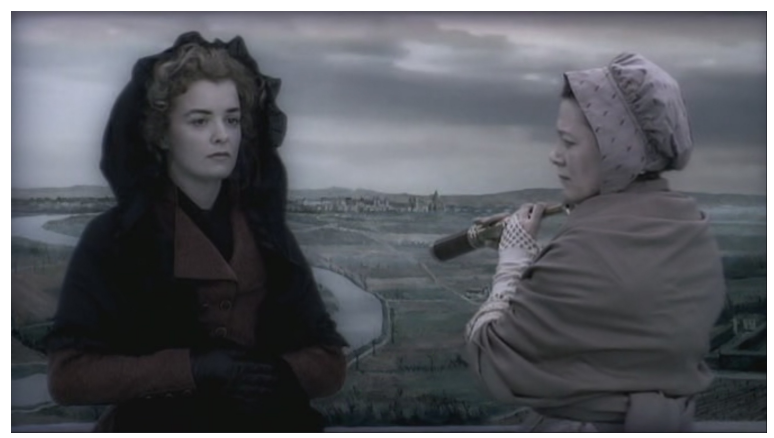
Performances of the past in Eric Rohmer's The Lady and the Duke (L'Anglaise et le Duc , 2001), where actors are digitally inserted into painted tableaux of historical vistas of Paris during the French Revolution.

The nonlinear effect of pure past created by the film's performance of the past lies in the fact that, unlike mimetic representation, which aims for recognition, resemblance and a homogenising understanding of reality, resulting in a chronological presentation of time, performance displaces the actual present of the past, "by which the past is embodied only in terms of a present that is different from that which it has been" (Deleuze, "Bergsonism" 71). Here, history is not just a way of chronologically arranging facts and events of the past, of understanding the past through the linear tracing of cause and effect, but is grasped through a different logic, where a nonlinear sensation of time allows us to enter the rhizome of the past. In such rhizome, history can be grasped through the artistic quality of haecceity—the spatiotemporal experience of speeds, movements, textures and affects.