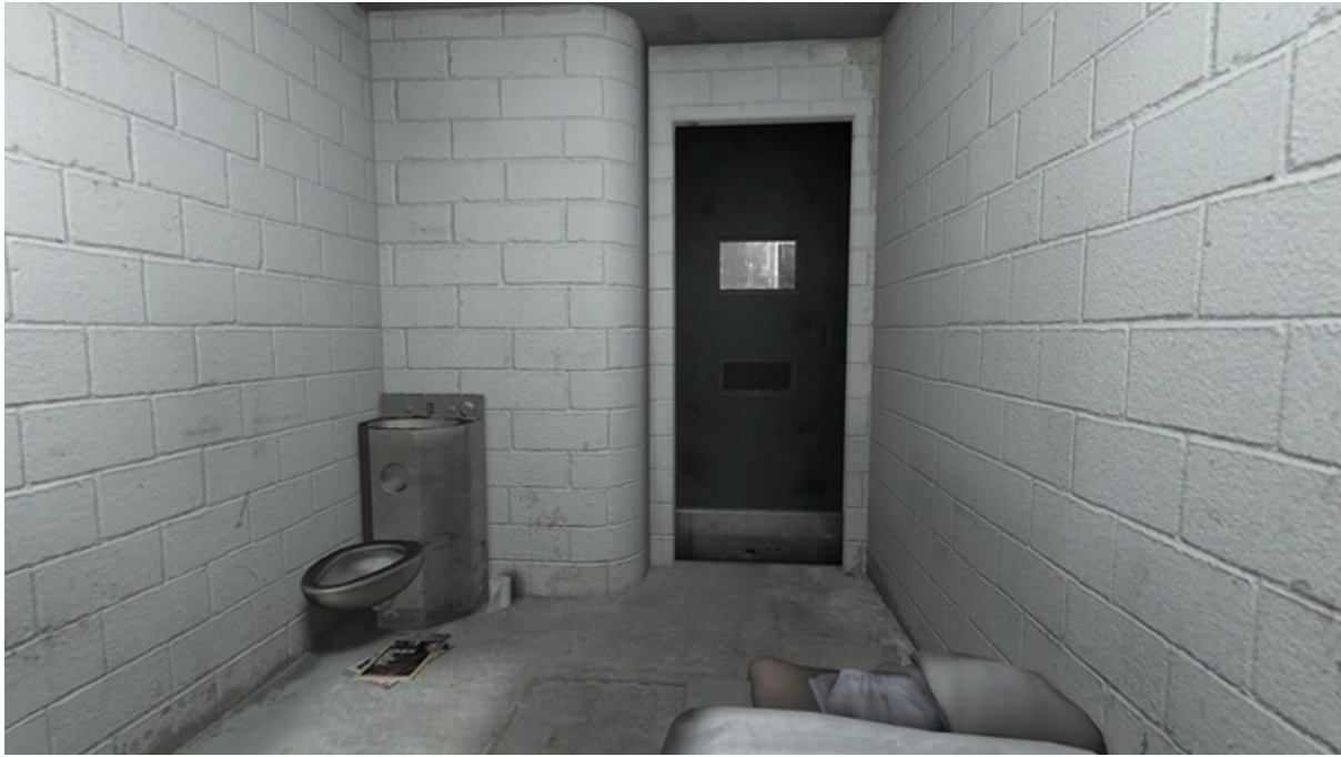
Figure 5: 6x9 (The Guardian, 2016). Screenshots.

On the other end of the immersive continuum we find VR and 360-degrees productions. Ranging from online documentaries to those designed for VR googles or smartphones, such products offer an interactive experience also allowing for what I elsewhere have defined as a form of “disembodied embodiment” (Favero, Present ; “Swallow”). Among such projects mention can be made, for what regards computer-screen-based films, of Google’s 360-degree productions Beyond the Map , on Rio’s favelas, and the Hidden World of the National Parks . With regard to goggle-driven VR documentaries we can mention, among many others, the works of Francesca Panetta such as 6X9 , a VR project on solitary jail confinement, or Notes on Blindness , an attempt at using VR to convey the experience of losing the faculty of seeing. Continuing to explore this terrain, we can also mention proper augmented reality experiences such as the India–US collaboration Priya Shakti which, among its various strands, engages with the augmented reality app Blippar in order to allow viewers to discover extra content while exploring images in physical space.