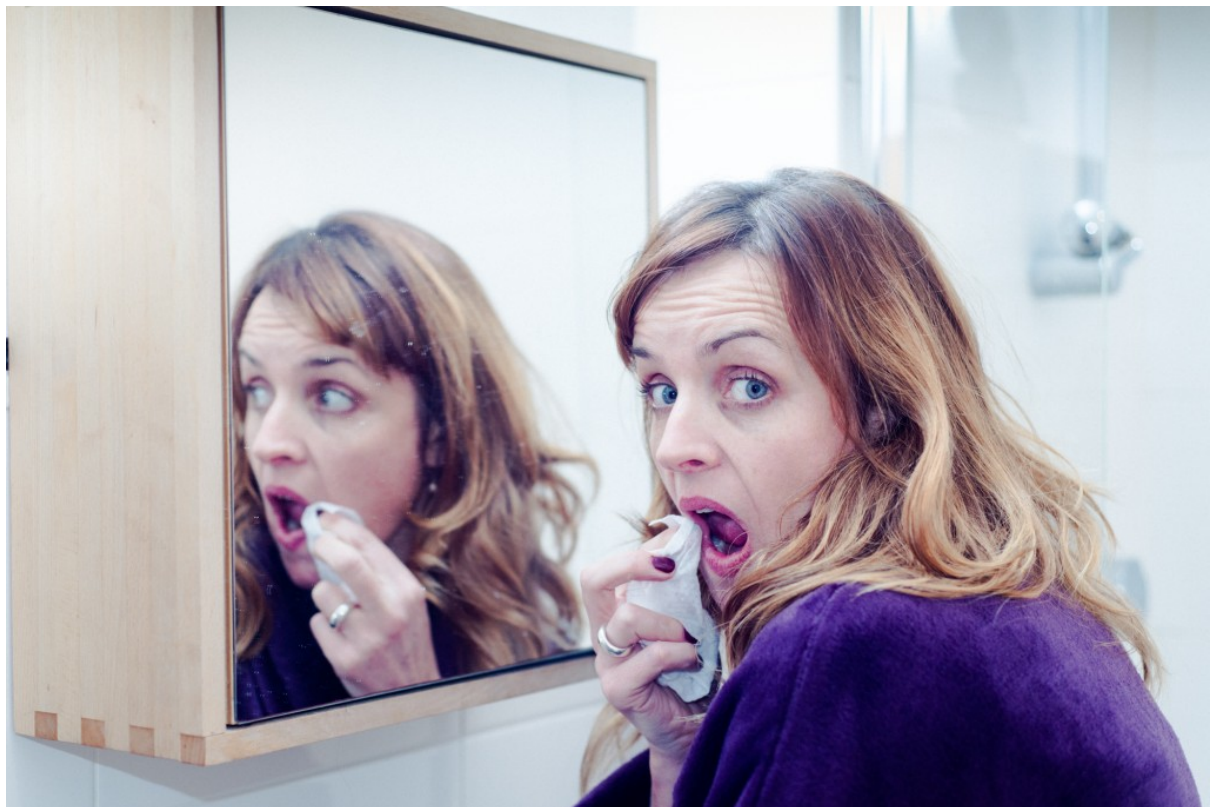
Figure 4: Karen (Blast Theory, 2015). Screenshot.

Finally, “immersive” i-docs are, in my view, the ones aiming more explicitly at closing the gap between the image and the everyday lived experiences of the viewers (both physically and metaphorically). Potentially experiential, haptic and/or emphatic, such i-docs move along a continuum that goes from expanded emplaced participation (bordering with augmented reality) to VR documentaries. Examples of this type can be found in Karen , a smartphone application bringing a therapist into the life of the user. Building upon the principle of provocation and nuisance, Karen sends out SMS-looking messages asking the users to connect with her. She progressively grabs information about the users’ views and habits and forces them to rethink their own lives. Indeed, while Karen stretches the definition of i-doc far beyond its conventional boundaries, I believe it also exemplifies the future direction of immersive i-docs. It is my view that i-docs should further exploit the possibility of inserting, especially through the use of smartphones, documentary material amidst the (emplaced) everyday life of its viewers, hence blurring even more the distinction between actual and virtual experiences.