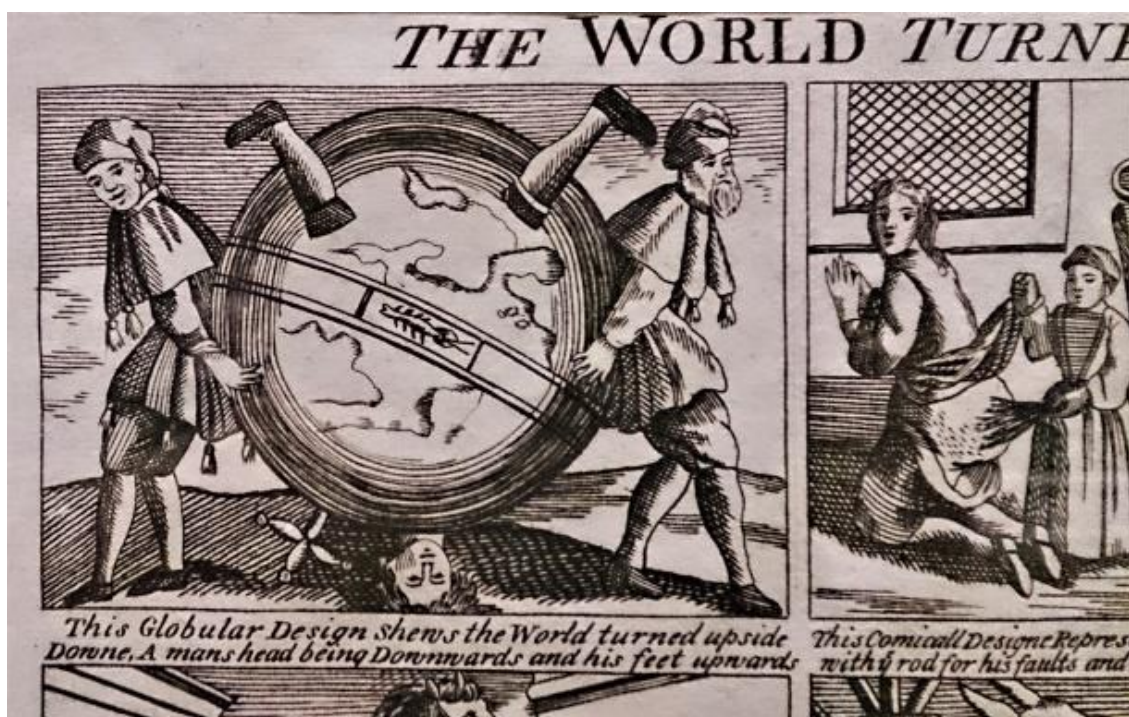
Figure 1: Academia—so much to unlearn.