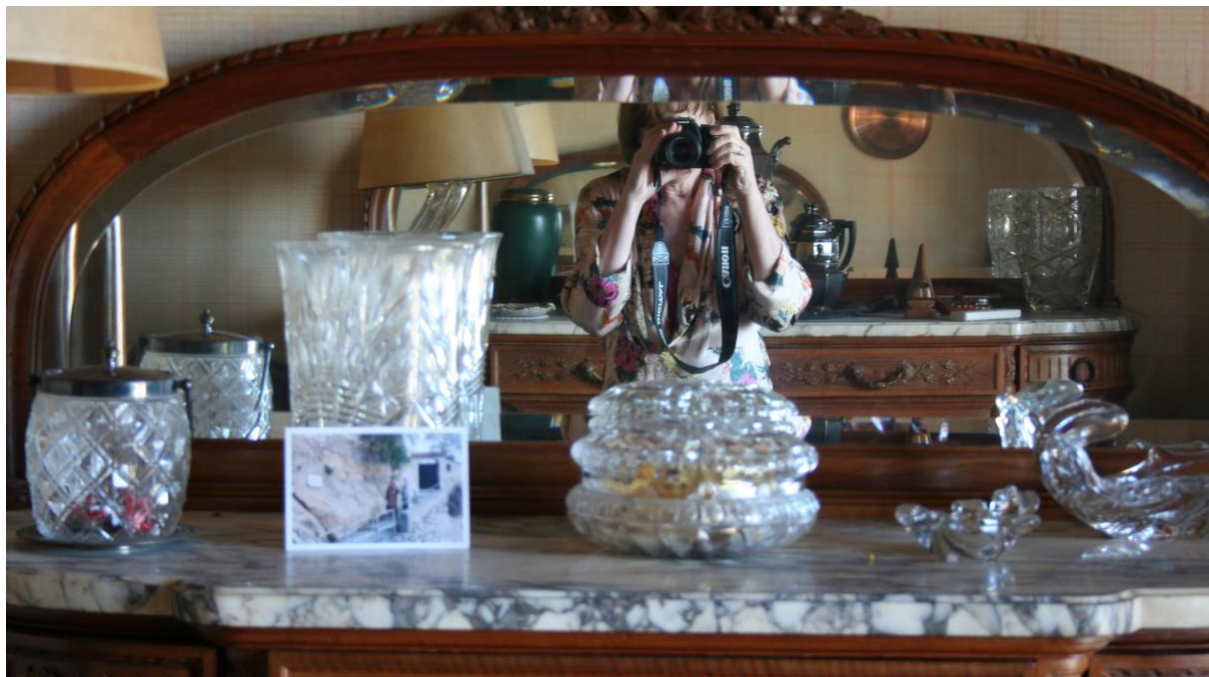
Figure 1: Journey to the South by Jill Daniels. High Ground Films 2017. Still.

In this case study of my recent documentary film practice I explore the notion that creative film practice produced from within the academy can create new knowledge. I suggest that although films communicate in a sensory mode that may defy written theorisation or