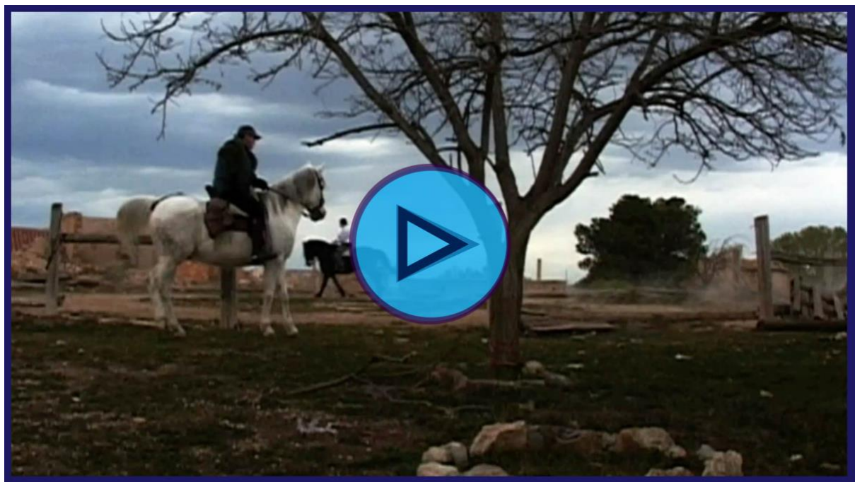
Figure 2 (top): Belchite. Figure 3 (bottom): Chance encounters. Not Reconciled by Jill Daniels. High Ground Films 2009. Screenshots with links to video excerpts.

The first film I made was for my practice-led doctoral thesis. Not Reconciled (2009) is a forty-minute film located in Belchite, a small town in northern Spain. It evolved from my interest in the history of the Spanish Civil War (1936–1939) and my earlier observation of privations and extreme inequalities in Spain in the late 1960s. There was no Truth Commission at the end of the Francoist era in Spain, no purge of the army or police and no assessment of the crimes of the regime. At the start of the twenty-first century, I became aware through the British press of the existence of unmarked mass graves in Spain. I chose to locate Not