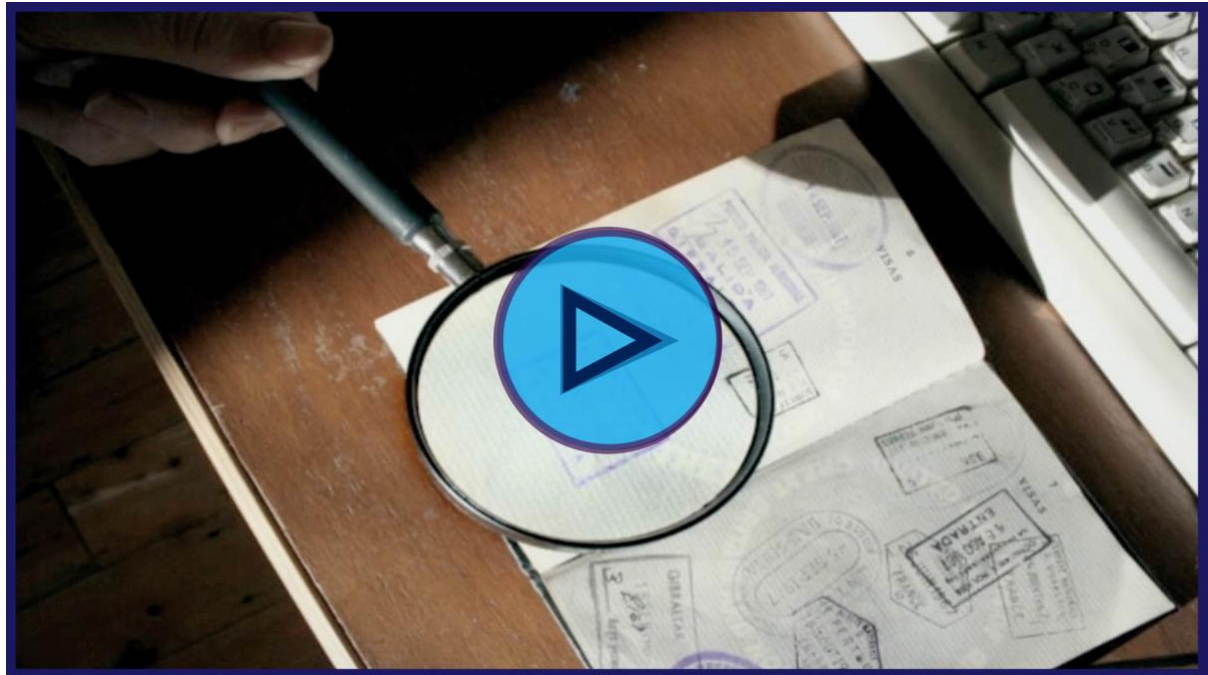
Figure 4: Inside the cars. The Border Crossing by Jill Daniels. High Ground Films 2011. Screenshot with link to video excerpt.

After the completion of Not Reconciled I turned to focus on autobiography. Delving into autobiography in order to mediate memory involved a process, an excavation, a digging deeper, which, I would argue, lends itself to experimentation, the poetic and the uncertain. It brings one a step closer to an acknowledgement that subjectivity and self-reflexivity may provide rich possibilities for the cultural exploration of the social world. However, autobiographical filmmaking always carries with it a challenge to the notion of the possibility of a unified subject. Where the filmmaker is both the subject and the object of the gaze, she is necessarily divided but it is that very division that, I would argue, makes it so compelling. The Border Crossing , a forty-seven-minute film, was the second film I made for my doctoral thesis. It takes a directly autobiographical approach to my memories of a traumatic experience, a sexual attack. The fact of the incomprehensibility of the violent experience continues to haunt me and has led to its non-assimilation through direct recall. I therefore chose to use my subjectivity, which, while breaching the normal standards of objective documentary filmmaking by including fictional and personal elements, would articulate a metaphorical evocation of the past in the present. After being sexually attacked while hitchhiking in the Basque country, I wrote an account of the traumatic event. Forty years later I felt sufficiently