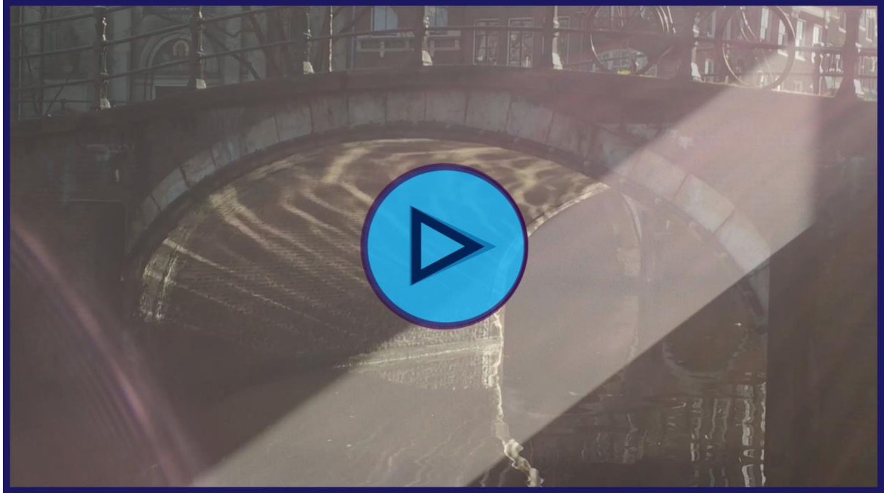
Figure 1: Alexander Nevill, iPhone Collage . Screenshot with link to video.

following a provocation from my supervisory team, I started filming an ad-hoc collection of moving imagery using my iPhone throughout daily activities which focused on rare or illustrative instances of ambient light.