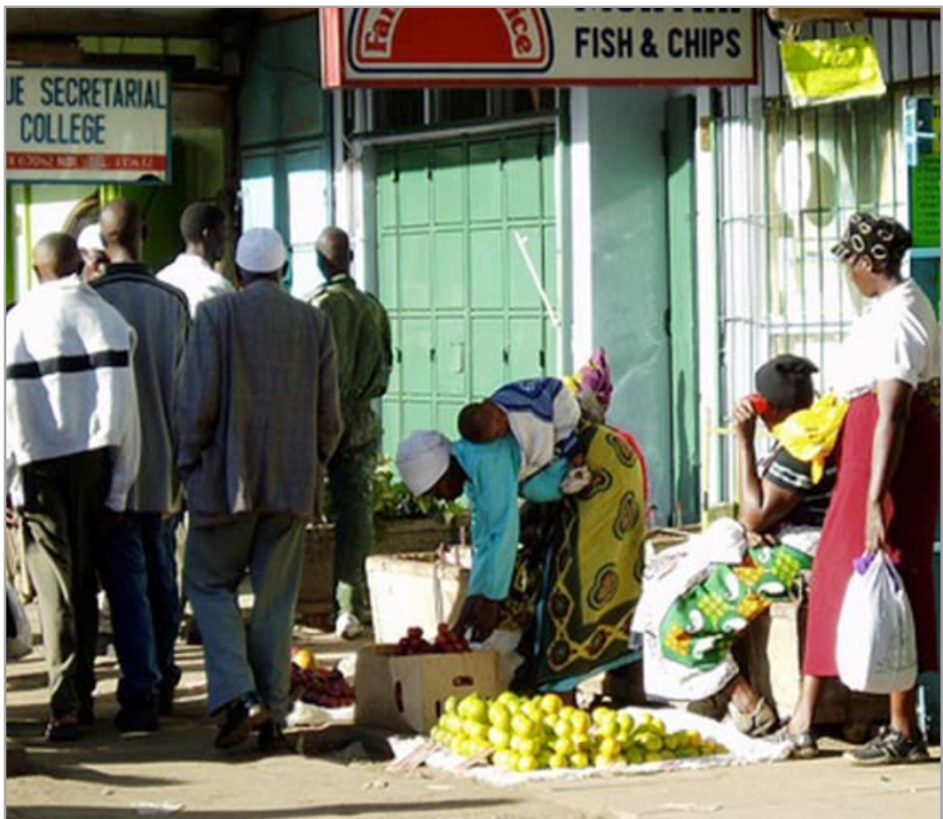
Figure 1: Fruit and Vegetable Street Hawkers, Nairobi, January 2007

the Global South, these needs and rights of these informal workers often confound formal and traditional mechanisms in urban planning, are not safeguarded by legal or social protections, and face persistence erosion of their rights and expulsions from public space (Bass 2000, Yankson 2000). Their experience in the context of accelerating urban forms of neo-liberalism presents an opportunity to interrogate the key actors and processes which are currently shaping the urban geographies in contemporary Africa (Fig.1).