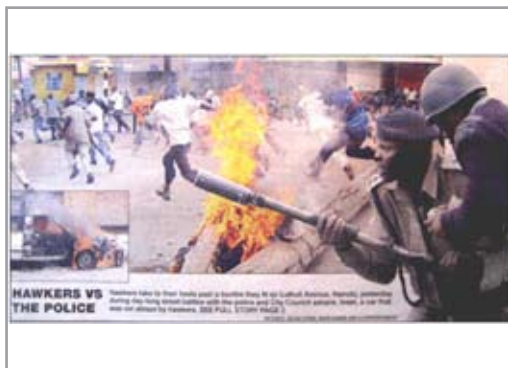
Figure 3: Police clash with Hawkers on the Streets of Nairobi, June 2006

bars, truncheons and axes is commonplace during these disturbances. One policeman and two hawkers were killed during these confrontations and the level of sustained state-sanctioned violence against this group of urban entrepreneurs was intense enough to mean that by the middle of 2006, for the city for the first time in a generation became ‘hawker free’ and largely remained so for almost 18 months. The ‘hawker menace’ had been removed, temporarily it turned out, as just two months before the 2007 election street traders were permitted to come back into the city centre again, in a bid to ensure support for Kibaki’s bid for re-election. However, the logic of claiming the city centre for ‘legitimate business’ and as a basis for Kenya’s bid to create a new globally integrated, ‘World Class’ city remains in place. As I write, street hawkers again face expulsion – some to take up a limited amount of trading pitches in Muthurwa, in the only market completed in the Nairobi in over a decade, but most, once again, will be deprived of their livelihoods and will be forced to depart into those spaces of urban oblivion beyond the neo-liberal urban imaginary.