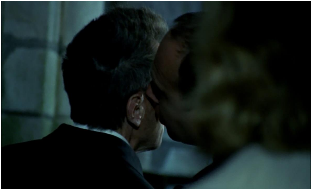
Figure 5: Itinerant listening amongst a distracted congregation in Adieu . ARTE France, 2004. Screenshot.