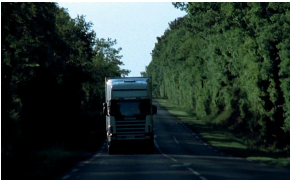
Figure 6: Tracking the lorry, Adieu . ARTE France. Screenshot.