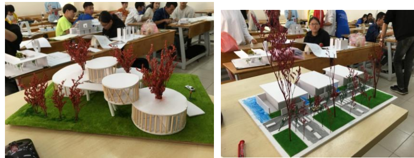
Figure 4: Group of students implement the project and correct as instructed by the lecturer.