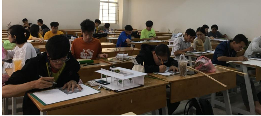
Figure 3: Students discuss, work in class.