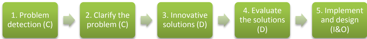
Figure 2: C-D-I-O process to do competition.

With an interesting topic and a design trend close to nature, which is an interesting architectural trend nowadays, the competition has brought excitement to the students. Being integrated into the content of the architectural composition subject helps students to be more excited with the subject when participating in the second year. The content of the competition is also consistent with the lesson "Architecture and nature" in this subject. A class with 30 students is divided into groups, with 2-3 students per group.