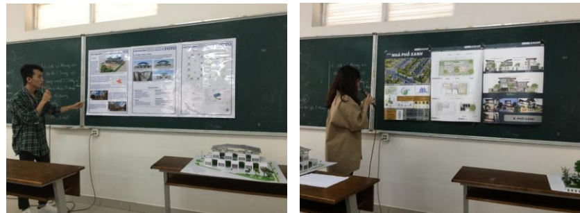
Figure 5: Student presentation exam report (Source: Author, 2019).