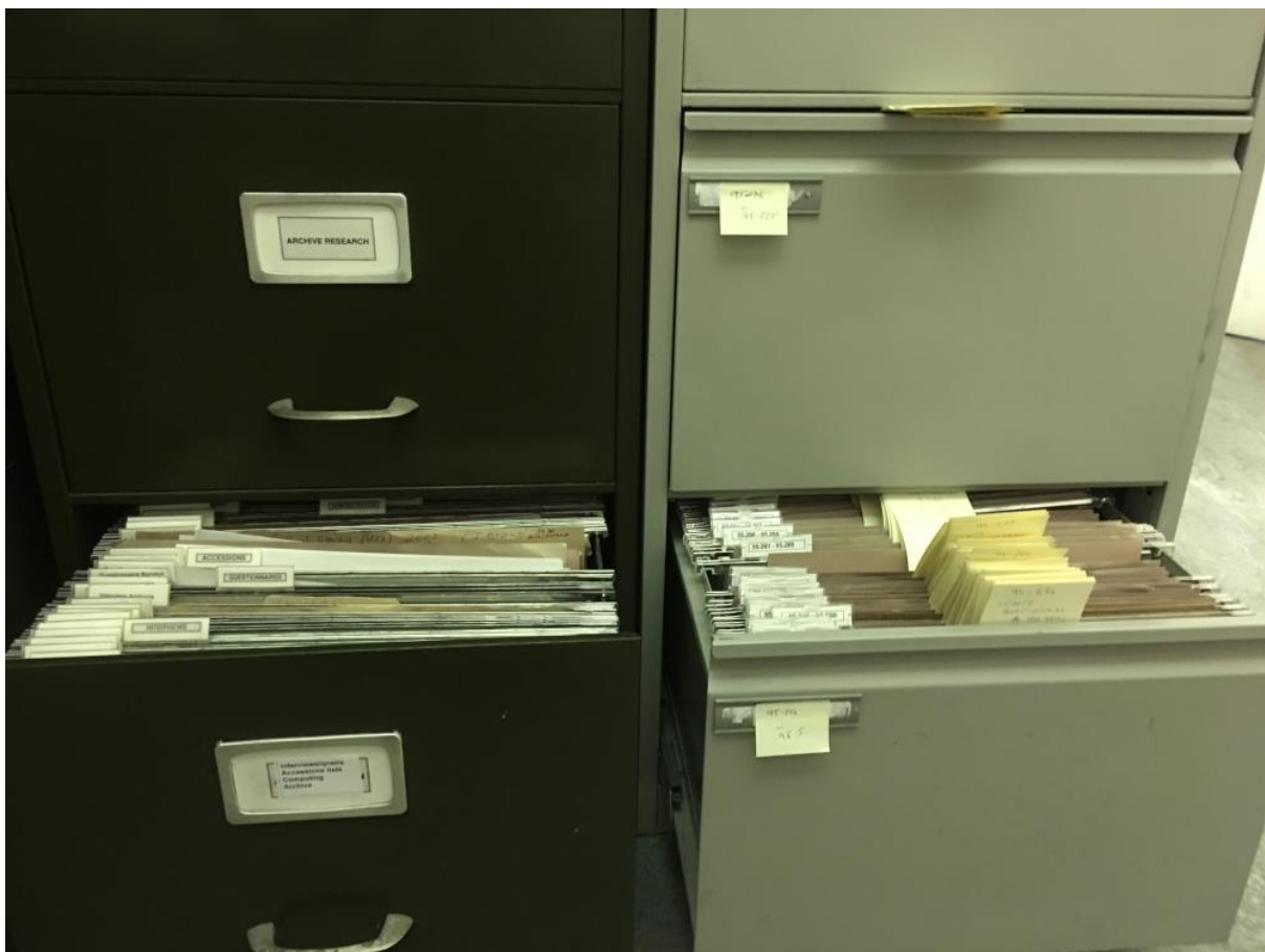
Figure 1: The original CCINTB project's filing cabinets.

Although the research resulting from CCINTB has populated and inspired the field of historical cinema audience research and memory studies, 4 the material itself has remained largely inaccessible to scholars, hidden away in storage boxes and cabinets in the depths of Lancaster University Library's Special Collections.