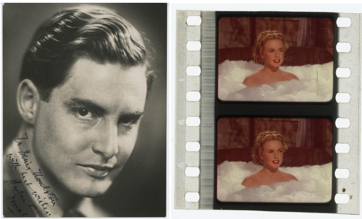
Figure 6 (left): Robert Donat Autograph from 1933 sent to Denis Houlston. Figure 7 (right): 35mm offcut: Deanna Durbin in Can't Help Singing (1944).

It has been of crucial importance to strike a balance between managing the collection for the physical and for the digital archive presented through the CMDA website, Lancaster University's library catalogue and Lancaster Digital Collections. From a traditional archival perspective, the need to fully survey, index and preserve the physical materials takes precedence, whereas now, within the digital humanities field and for CMDA, the digital aspect and the need for preservation and presentation of the digital materials are the overriding objectives. Although the archiving and display of the material within the Special Collections area needed some consideration, the presentation of the digital materials has been instrumental in informing the overarching approach and structure of the collection. Primarily, it more readily enables, and makes visible, the interconnectedness of the materials, and will also facilitate findings emerging from the QDA process to be fed into the functioning of the search engine. Records and display of the material nevertheless have needed to be adjusted to the specifications of the individual platforms and differentiating between the varying requirements has proved challenging at times. Transparency and consistency, both in view of the system and in detailed documentation of the progress, have therefore been essential in maintaining an overview over the development of the archive.