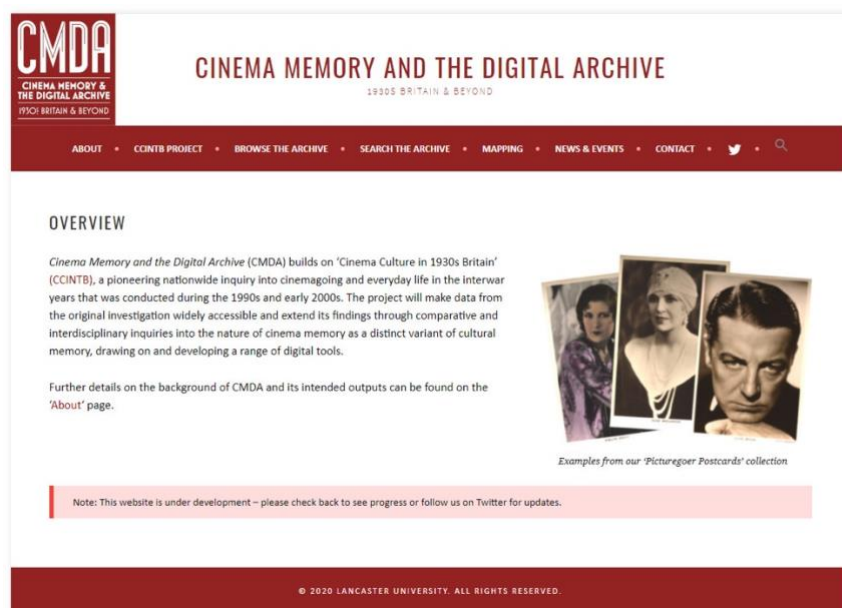
Figure 4: Screenshot of the CMDA project website.

Resulting from useful comments received in our first Steering Committee meeting, discussions also ensued on the merits of having two entry points to the site, or two routes through it, one for professional researchers and one for the wider public. 8 This idea was eventually thrown out as likely to prove unwieldy in practice, in favour of an emphasis on the use of clear pointers to content and functionality throughout the site, with the aim of making it intelligible and accessible to all. This key focus on usability also specified the need for both simple and advanced search mechanisms for querying the project database, which will act as repository for all digitised material from the collection. Once core functionality and a skeleton navigation system for the site had been agreed, attention turned to its visual appeal, often referred to by web designers as the “look and feel”. Here, an emphasis has been placed on creating a simple yet flexible design for the user interface that facilitates both the easy incorporation of new areas, and the showcasing of key items from the collection as digitised versions become available.