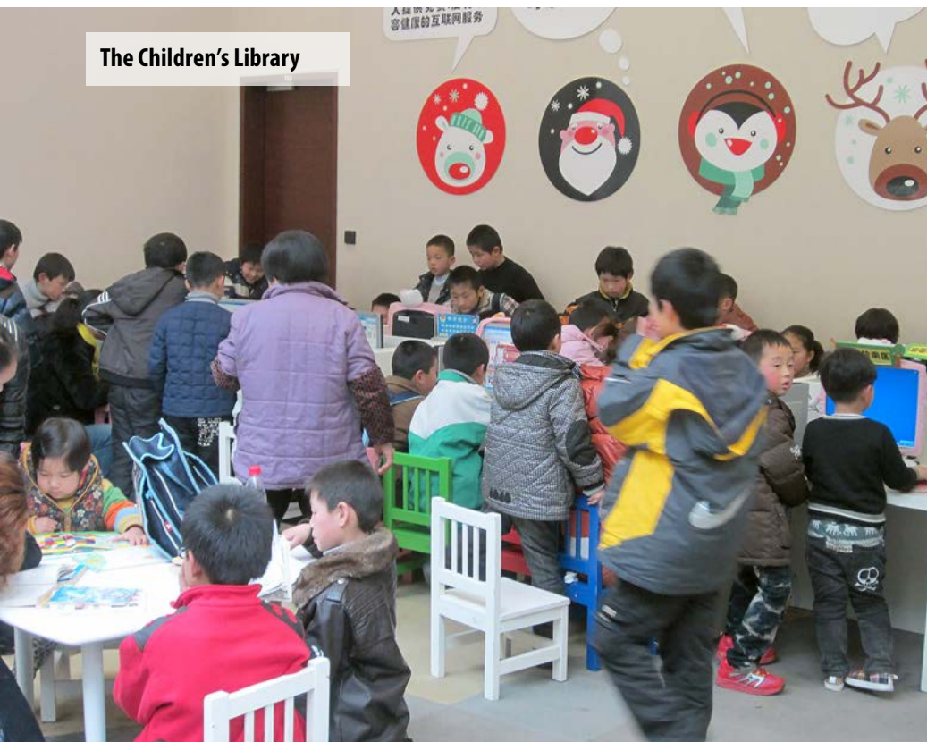
The Children's Library

and Friedrich Engels, A2 – the works of Vladimir Lenin. Further sub sections are allocated to Stalin, Mao Zedong, and Deng Xiaoping – the Chinese leader who came after Mao and who opened China up to Economic Reform. We felt it appropriate that a library Classification System for a nation espousing a Communist Ideology would place primacy on the leading thinkers of that ideology.