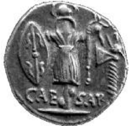
Fig. 1. — A denarius from Julius Caesar's second issue of civil-war coinage in 48BC (RRC no. 452, 2).