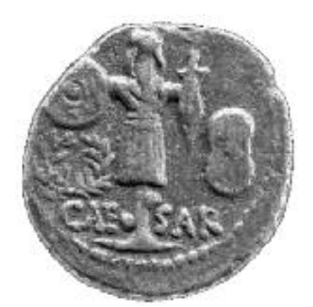
Fig. 2. — A quinarius from Julius Caesar's second issue of civil-war coinage in 48BC (RRC no. 452, 3).