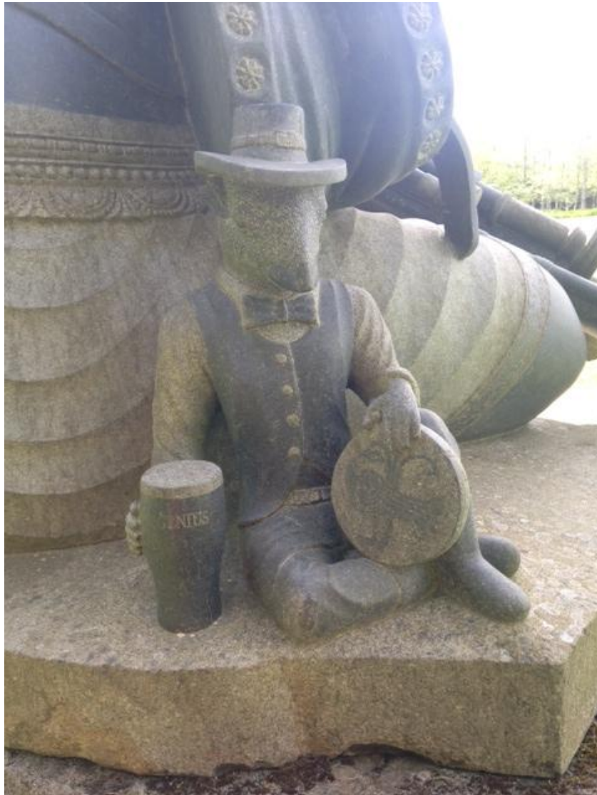
Figure 3: The mouse accompanying “Paddy Ganesh”.

One sculpture has been given an Irish identity. It is called “Paddy Ganesh” and features Ganesh playing the uilleann pipes with a shamrock on his hat. The sash going across Ganesh’s back shows celtic knotwork whilst the mouse accompanying him is carrying a bodhrán and has a pint of “genius” in his hand (see Figure 3).