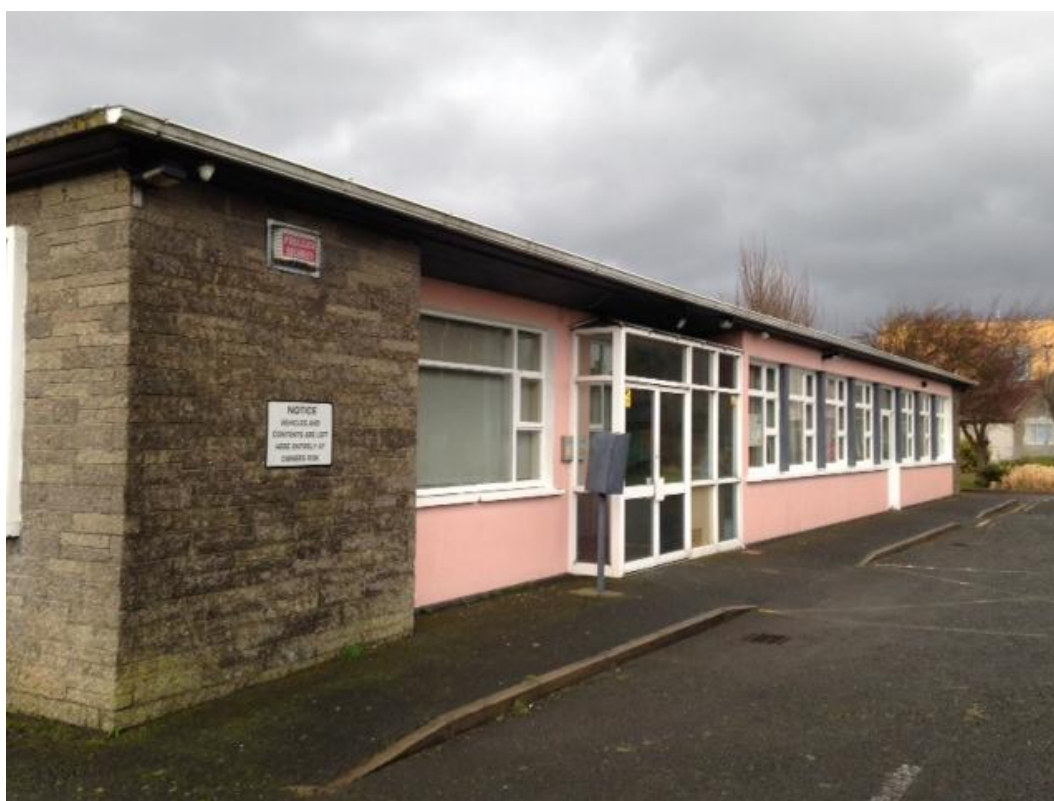
Figure 1: The building used as a temple by the Hindu Cultural Centre of Ireland (HCCI) June 2013-January 2015.

The paucity of public places of worship for Hindus in Ireland has meant that some Hindus have improvised over the years and used existing non-Hindu religious structures as places of worship. One Hindu woman from India who has been living in Ireland for over thirty years told me that up to ten years ago she used to go regularly to the local Catholic church to pray and has also gone on pilgrimage to Knock with her local community group. She explained that for her there is only one god but there are different ways to worship the same god. This attitude towards worshipping the divine in different aspects translates into diversity when it comes to recognising places and objects as religious.