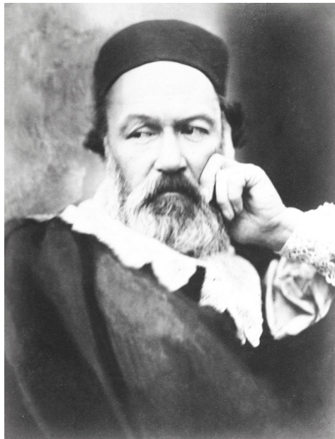
Fig. 1: Alfred Elmore c.1860s.

and elected to full membership in 1857; he was made an Honorary Member of the Royal Hibernian Academy (RHA) in 1878. 9 According to the Art-Journal he travelled throughout Europe at various times between 1833 and 1839, and again from the summer of 1840 for a period of about two years. 10 While engaged in his travels he continued to send work to the British Institution (BI). A Subject from the Heiress of Bruges , shown in 1835, was inspired by the novel The Heiress of Bruges: A Tale of the Year Sixteen Hundred , written by the Irish-born author, Thomas Colley Grattan. In 1837, he exhibited a scene from Shakespeare's Henry IV, Part I , a play he would revisit in 1851 at the RA.