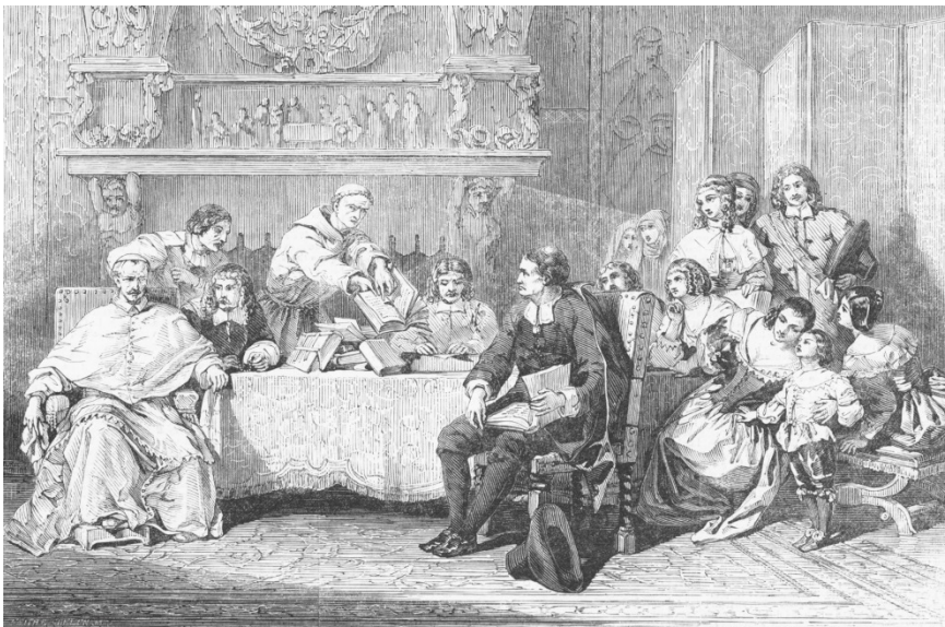
"RELIGIOUS CONTROVERSY IN THE TIME OF LOUIS XIV."—PAINTED BY A. ELMORE, A.

Aggression, paintings referring to religious incidents or rituals were open to interpretations unintended by the artist. In discussing Controversy , the Tablet , a Catholic organ, said 'of Elmore's we saw little more, for the crowd it attracted' but when its correspondent did get to see the painting it could only add that Controversy 'is a striking picture, the Monk in which has the best of it in a dispute with one of the "Reformed"'. 26 Meanwhile, the Art-Journal interpreted the 'Reformed' as the victor with the Capuchin exhibiting 'zeal which is scarcely tempered by discretion' while the Protestant is self-possessed and determined and the 'countenance' of the cardinal shows that his fellow Romanist is losing the debate. 27