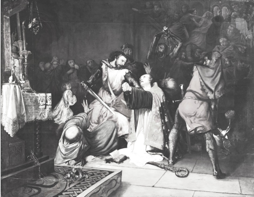
Fig. 2: The Martyrdom of Thomas á Becket (1840) oil on canvas, St Andrew's Church, Dublin.