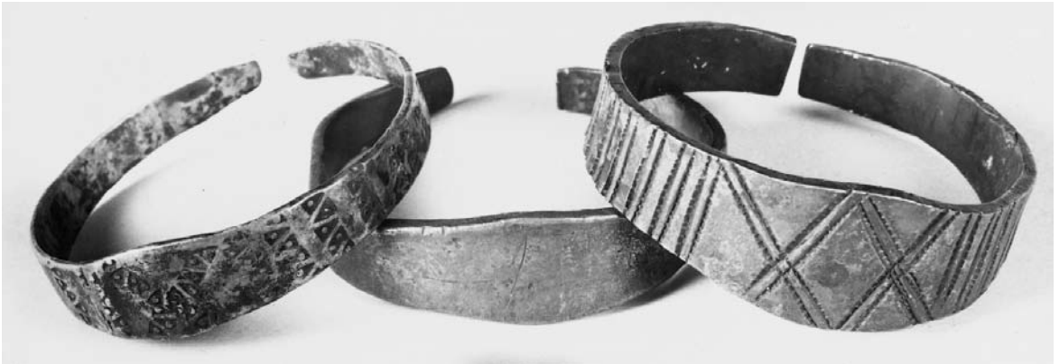
Fig. 1. Selection of Hiberno-Scandinavian broad-band armrings from Ireland.

naments of Hiberno-Scandinavian type. The most remarkable of these three, however, is that from Dysart Island, Co. Westmeath, which was deposited c. 907 and consists of eighty-five ingots and ingot fragments as well as twenty-nine pieces of cut ornaments (M. Ryan et al 1984, 339-356). As with the other mixed hoards from Ireland this find has particular implications for the dating of the coinless hoards but, in addition, it is the only hoard known to contain highly fragmented hack-silver derived from a wide variety of ornament types.