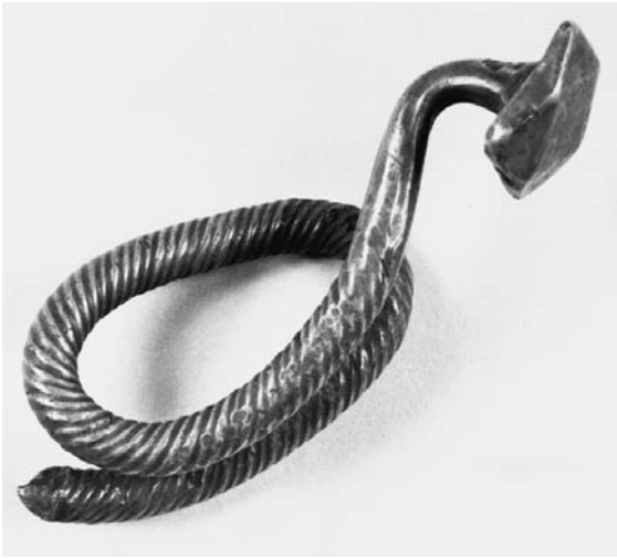
Fig. 4. Fragment of a 'Permian' spiral-ring from Ireland, unprovenanced.

from Ireland – that from the Dysart Island mixed hoard of coins and hack-silver (M. Ryan et al 1984, 356-361). Its results indicated that this silver was not won from any known ore source in Ireland and, in addition, that the silver used to produce the Dysart ingots derived from broadly similar sources to those represented in the hoard from Cuerdale (Kruse 1992, 81) – a finding which is of some interest in that the Dysart and Cuerdale hoards share other important characteristics (Graham-Campbell 1987c, 112). In Britain, however, several analytical programmes have been carried out on a broad range of non-numismatic silver objects, including some from hoards with strong Hiberno-Scandinavian elements, and in some cases it has proved possible to demonstrate the probable use of Arabic and/or Anglo-Saxon silver as the source for particular objects. In the case of the Skaill, Orkney, hoard, for instance, the compositions of some of its ornaments and ingots were shown to be similar to those of Arabic coins (Kruse & Tate 1995, 74-75). On the other hand, the composition of some of the components of the hoard from Storr Rock, Skye, were closer to those