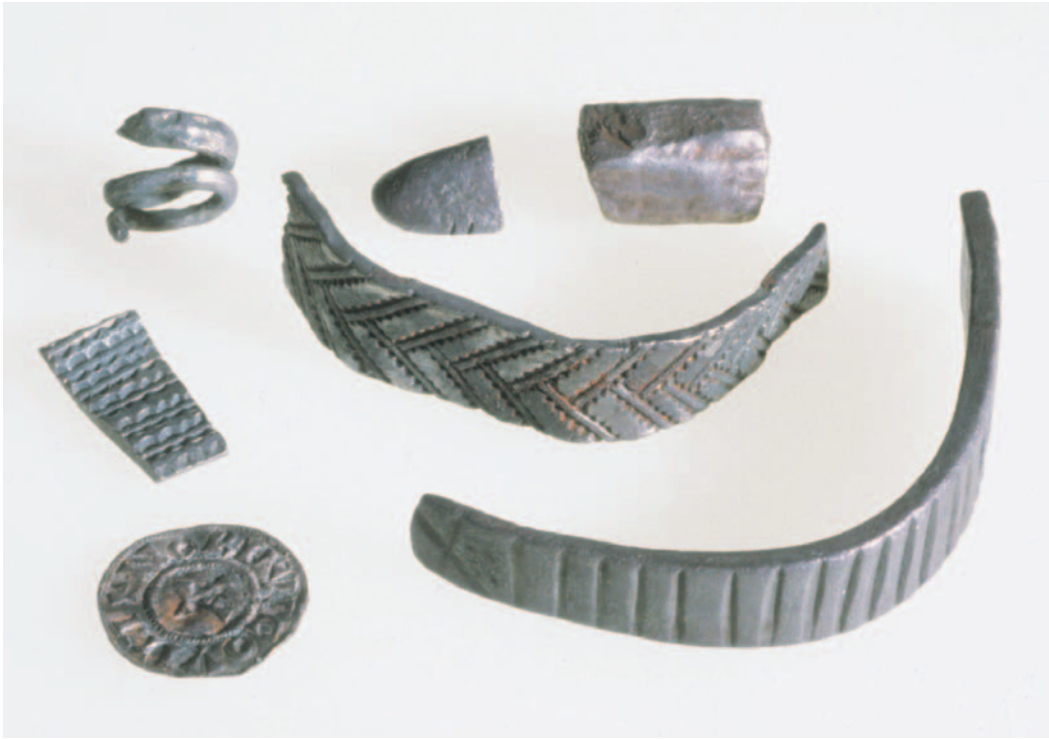
Fig. 2. Mixed hoard, with hack-silver, provenanced to 'Co. Antrim.'

lowing the establishment of the Hiberno-Norse mint in Dublin in c. 997.