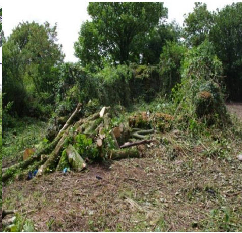
Figs. 4 and 5: How the site looked before work began, and after the trees were cut back to reveal the outline of the three walls. These images give a sense of just how overgrown the site was before the group worked to save it.