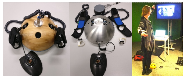
Figure 2: The Haptic Bowl (left), Non-haptic Bowl (center), and User for Scale (left).

The Non-Haptic Bowl is also an isotonic, zero-order, alternative controller, based upon PING))) ultrasonic transducers and basic infrared (IR) motion capture (MOCAP) cameras. The components are arranged as digital inputs, via an Arduino Micro, and MOCAP cameras are attached via an integrated USB hub. The MOCAP system is crafted from modified Logitech C170 web cameras with internal IR filters removed and visual light filters covering the optical sensors. An IR light emitting diode (LED), embedded in a ring, is then used to provide a tracking source for the simple MOCAP system. The constituent components are contained within an aluminium shell, similar in size and shape as the Haptic Bowl. The use of these sensors best matched the input capabilities of the Haptic Bowl, ensuring a comparable interaction. However, the device has fewer movement restrictions than the Haptic Bowl, as no physical contact is required.