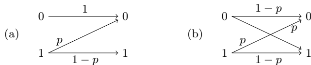
Fig. 1. A Z-channel (a) and a standard Binary Symmetric Channel (b).

In the following, we use the name Z-channel to refer to a binary Z-channel, where (x_1, x_2) = (0, 1) and (y_1, y_2) = (0, 1) . Using these symbols, the behavior of the Z-channel closely resemble that of a binary symmetric channel, except for the fact that the noise is affecting the communication asymmetrically (see Fig. 1). In practice, we can transmit a “0” through the channel noiselessly, while sending a “1” we have a probability p that it will be received as a “0”.