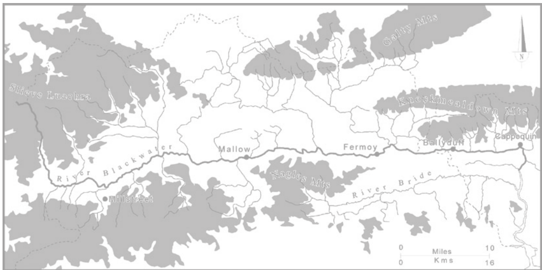
Figure 1 Blackwater River

pertinent issues in relation to the nature of improvement, farming and landscape conditions at that time. It also questions notions of representation (Barnes & Duncan 1991). Finally it must make us consider what exactly was a 'Survey' (Andrews 1985).