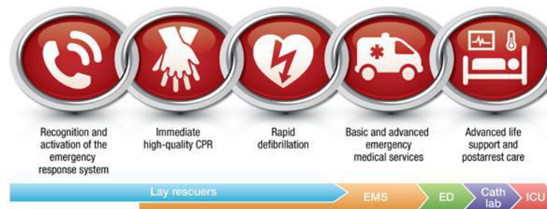
Figure 1 Each interdependent link in the chain is essential for a good outcome following an SCA.

The “chain of survival” concept has evolved through several decades of research into SCA. 12 Survival from SCA is more likely if a particular sequence of events occur as rapidly as possible. The five links in the adult chain of survival, as outlined by the American Heart Association, 12,13 are outlined in Figure 1 . Critically, laypersons form the first three links of the chain.