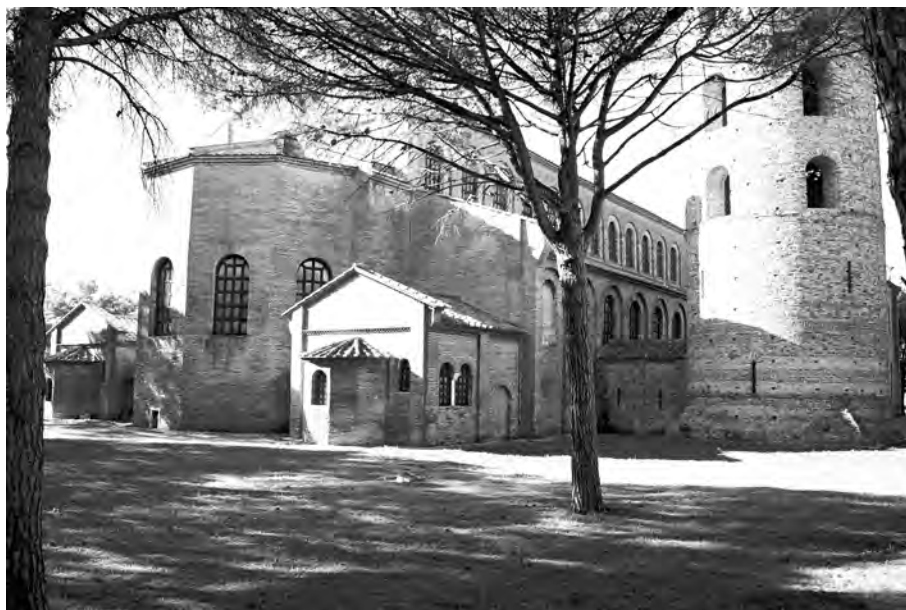
4 Eleventh-century freestanding belfry next to sixth-century basilica of St Appolinare in Classe just outside Ravenna.

architectural innovation as ever more elaborate churches were built over these graves, along with increasingly sophisticated solutions to the problem of accessing their contents without disrupting the liturgy. 92 However, in Ireland the principal church was not a memoria built to provide a suitably impressive setting for the saint's primary relics; rather, it can itself be viewed as a secondary relic of the saint, having originally been built by him. In this regard they are like the crosiers and bells which were clearly seen as secondary relics though they were not made until long after the saints with which they were associated had died. 93 Peter Harbison has suggested that relics were kept outside in the cemetery because of the simplicity and modest size of Irish churches, 94 but it seems unlikely that such an important decision was determined by mundane space management issues. I have argued elsewhere that the Irish had clear symbolic and social motivations to maintain the link between relics and the cemetery, 95 and the evidence discussed here suggests they had equally compelling reasons to keep their congregational churches simple.