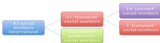
Figure 1: Career decisions and retention in child protection and welfare