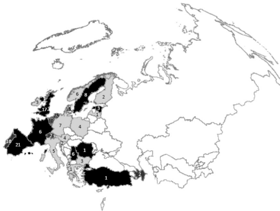
Figure 2 Map of the WHO European Region showing the total number of burden of disease studies conducted for each Member State and the most comprehensive type of study for each. Colours illustrate the most comprehensive type of study for each Member State as follows: light grey shading with black text—specific studies (including multicountry a ); dark grey shading with black text—extensive study; dark grey shading with white text—full, sub country study; black shading with white text—full, country study b

a Please note that specific multicountry studies that cover over half the Member States ( N=17 ) are not included on this map.