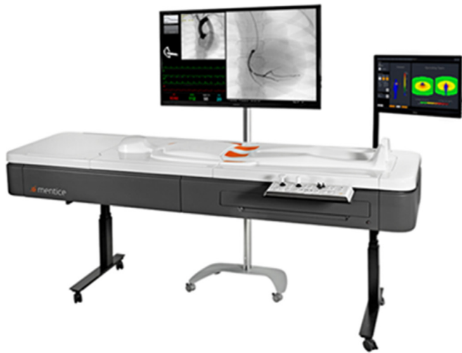
Figure 1 The vascular interventional simulation trainer (VIST) virtual reality simulator.

endovascular simulator which enables hands on procedural training for clinicians using real patient cases. This technology allows the use of the medical devices for simulated endovascular procedures. In replicated real world scenarios, it provides step by step guidance and metric based feedback throughout the procedure. 15 16 The haptic feedback to the users' actions are calculated in real time and depend on the interaction between the virtual devices and the virtual anatomy (vessel geometry and vessel properties), and give realistic tactile feedback to the operator during the training procedure. 15 16