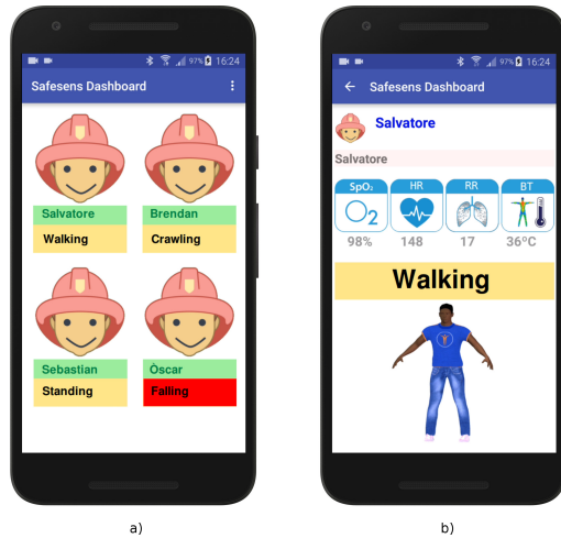
Fig. 2. Screenshots of the team leaders' application showing a) the dashboard, and b) the screen with details of the current HAR estimate.

In this demo we shall limit ourselves to the HAR component, for which we have developed an Android application whose initial screen is shown in panel a) of fig. 2. This screen illustrates the status of up to four first responders, showing, for each of them, the most recent activity, according to the output of the HAR algorithm, and highlighting it if and when appropriate—e.g., to issue a “firefighter down” alert if a firefighter is thought to have ceased moving and be lying on the ground. Team leaders can tap on a first responder’s icon to access a second screen (panel b) that provides more detail about the HAR estimate, and illustrates the most likely activity by means of a 3D model.