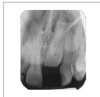
FIG. 4 On subsequent examination there was evidence of ankylosis and the tooth became submerged. As all other options have failed, a decision was made to surgically reposition.