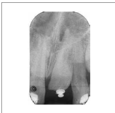
FIG. 3 Active rapid orthodontic repositioning of the UL1 intruded tooth was attempted at 4 months but the tooth resisted and no movement occurred.