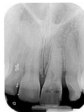
FIG. 6 Radiograph taken 1 year after surgery. There is evidence of sclerosis of the root canal of the UL1.

canal obliteration apically, but coronal pulpal tissue evident, distal bone loss, but no periapical pathology (Fig. 6). The tooth is being monitored regularly for endodontic treatment need.