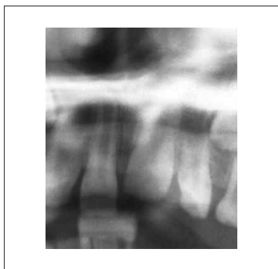
FIG. 2 The upper left permanent central incisor (UL1) with an immature apex is moderately intruded in a 7.5 year old. It was decided to monitor for spontaneous re-eruption as indicated in the guidelines.