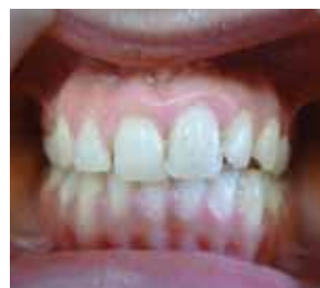
FIG. 5 The surgically repositioned upper left central incisor (UL1) after splint removal.

The tooth was clinically firm and the patient is very content with the appearance (Fig. 5). It was not tender to percussion, it remained positive to vitality testing and the periapical condition was normal. The oral hygiene and gingival conditions were fair and the gingival crevice readings for the tooth were 2 mm. The gingival attachment labial to the upper left central incisor remains slightly higher than that seen in the adjacent teeth. The post-operative periapical radiograph illustrates its current position, with root