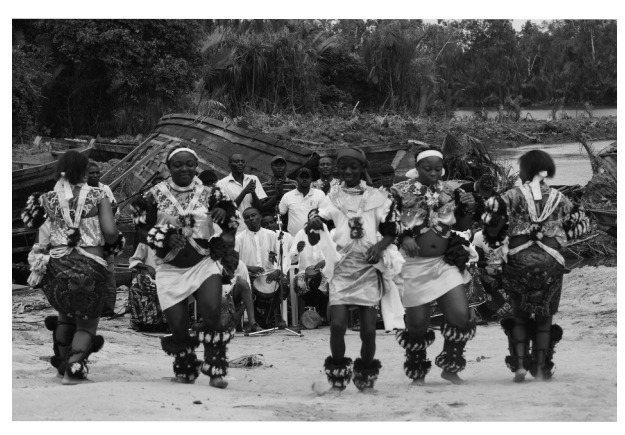
Fig. 10. Young girls in traditional costumes dancing ekombi dance.

The dancers are young girls whose arm and leg movement imitate the waves of the sea. The ensemble consists of a chorus of male singers and drummers. The instrumental ensemble includes: ekpiri ekomo (small drum), ayara ekomo (male drum), uman ekomo (female drum), nkon (bell) and nsak (rattles).