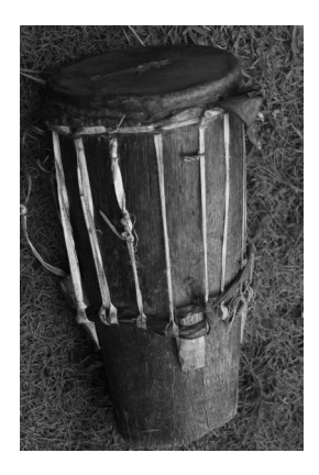
Fig. 5. Ekomo drum (Calabar, Nigeria).

On one particular occasion, as Cuti and I began to play the drums, a circle of onlookers around us was formed and suddenly an old woman broke into the arena dancing in front of us. Later, Prof. Meki told us that what had happened had opened a channel of communication between "us" and "them" and that the fact that the old woman spontaneously decided to dance meant that we had been accepted by the community (this moment was immortalized by the cameras). The interaction with local musicians and elders in order to establish a more direct and friendly connection with them through music facilitated (apparently) the process of communication between "insiders" and "outsiders".