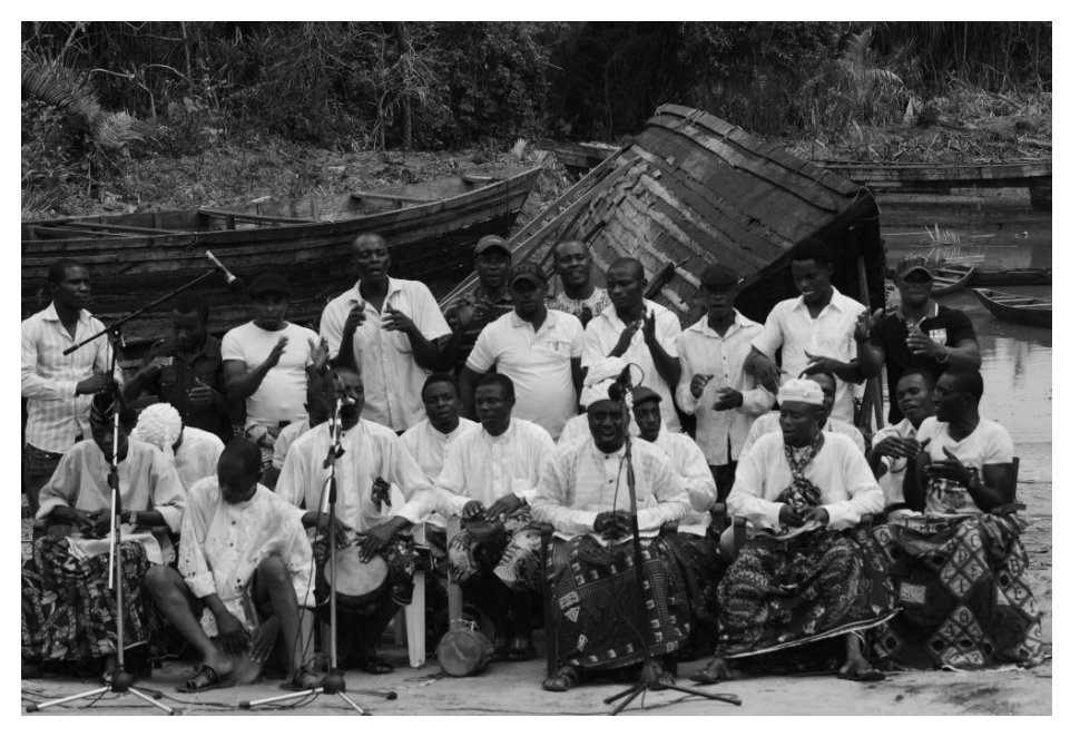
Fig. 11. Ensemble of singers and drummers accompanying the ekombi dance.