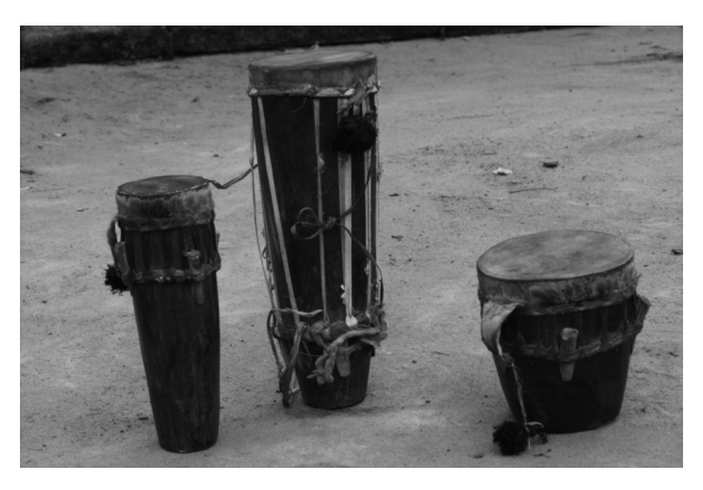
Fig. 4. Ekomo drums: ekpiri ekomo, ayara ekomo, and uman ekomo.

drum"), and uman ekomo ("female drum"). The drum ensemble is completed by nkon (bell) and nsak (rattle). These drums had a strong resemblance to the Afro-Colombian drums, such as the llamador and tambor alegre , used in the Caribbean coast, and the cununo , used in the Pacific coast.