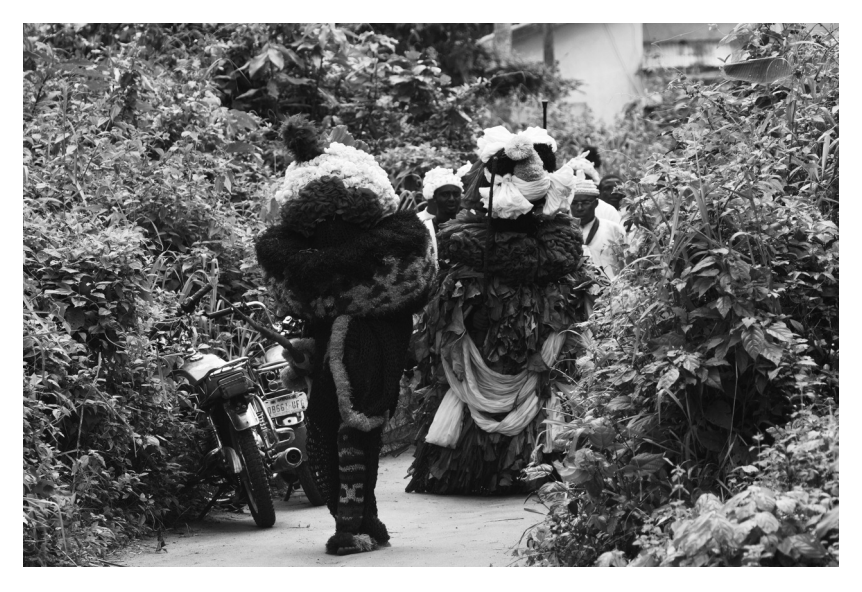
Fig. 13. Ekpé masquerade performed by two masks: Ekon Ekpé and Atemtem.

At the end of the ekpa funeral rite, an old woman came to thank us for having revitalized the ekpa , because it was almost extinct. It had not been held for over thirty years in the village and many young people of the village had never had an opportunity to see it. The "motivation film", thus, played a determinant role in the process of revitalization of a ritual that was to be almost extinct although it was still alive in the memory of the village elders of Esuk Mba.