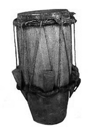
Fig. 6. Cununo drum (Pacific coast, Colombia).