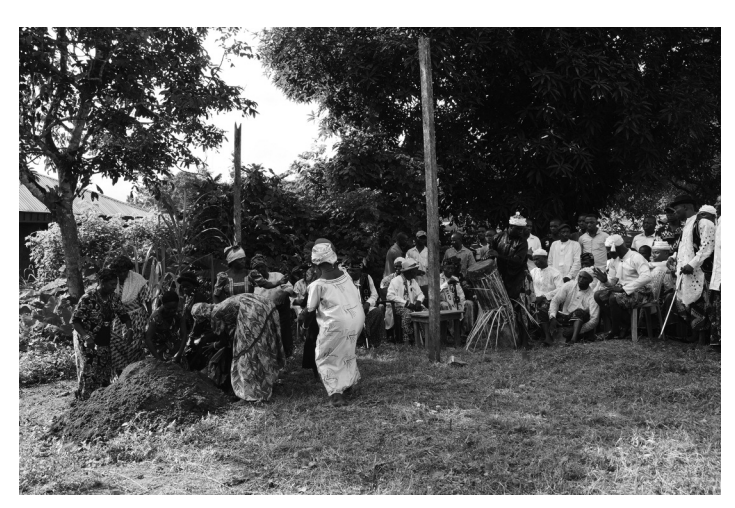
Fig. 12. Women of the Ekpe female society performing ekpa dance around the tomb while a percussionist plays the ibid ekpa drum.

The so-called "mise-en-scene" has also played a decisive role in revitalizing nearly extinct traditional practices. In this regard, it's appropriate to mention the case of the ekpa . The ekpa is an Efik funeral rite performed with drums and danced in the village of Esuk Mba by the elder women's initiatory society in honor of a deceased man or woman over the age of 60. After the propitiatory libations, the dance begins and is performed around and above the tomb, while earth is thrown into the pit. Only when the burial is completed do the men come to dance with the women around the tomb. In the traditional percussion ensemble, used for all the dances in the village, an ekpa or big drum ( ibid <sup>8</sup> ekpa ) joins in, only and exclusively in its role as a "feminine" drum. The ekpa music is performed only by initiates, generally those whose mother or grandmother were part of the ekpa female initiatory society. The songs may have a moral significance or they may deal with the life of the deceased. It was indeed amazing to find some similarities between this ritual and the Afro-Colombian lumbalu , a funeral rite performed in the past by the older women in Palenque de San Basilio (a Colombian village inhabited by descendants of runaway slaves) for a member of the cabildo (council of the elders), where a very similar big drum was used called pechiche (D'Amico 2002).