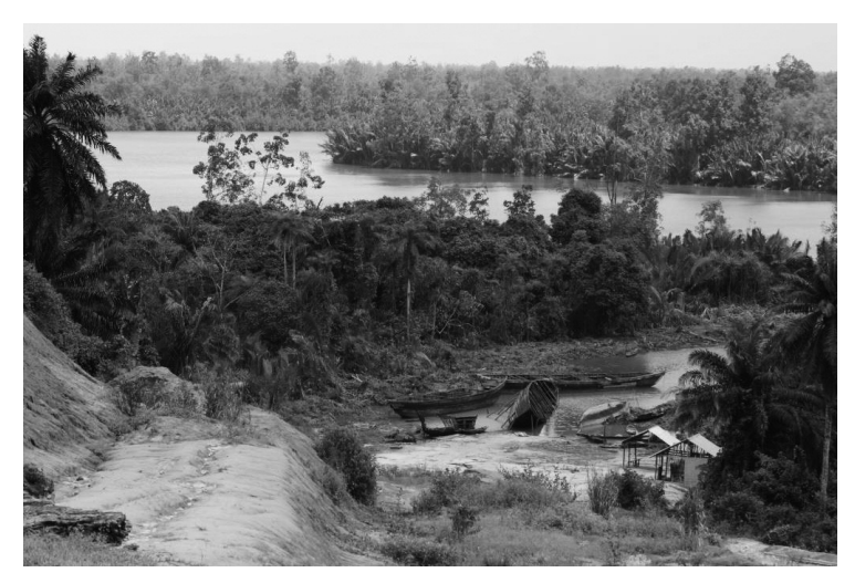
Fig. 9. Port of Esuk Mba (Cross River State, Nigeria).

Four traditional dances have been planned following the suggestions by Etim Okon Inyang, a local traditional musician and leader of the village musicians, initiated to the Ekpé secret society. The dances were ekombi (a female dance in honor of the spirit of water or mermaid Ekombi ), abinsi (a courtship dance in the form of a pantomime), ekpa (a funeral rite of the elderly) and the ekpé masquerade (and initiatory dance involving the use of masks).