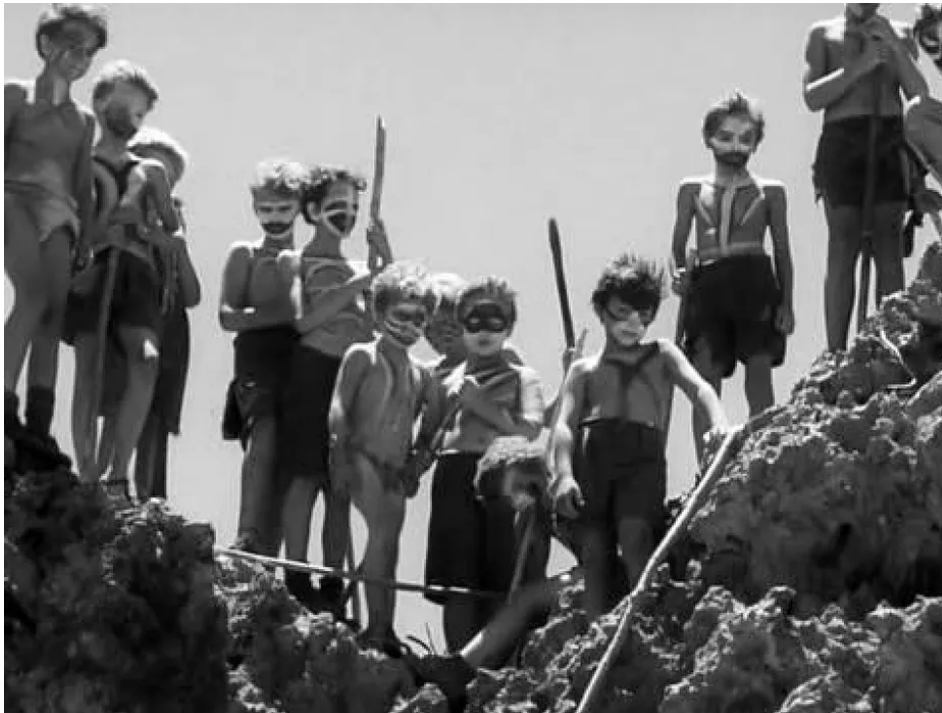
A still from the 1963 film of William Golding's Lord of the Flies .