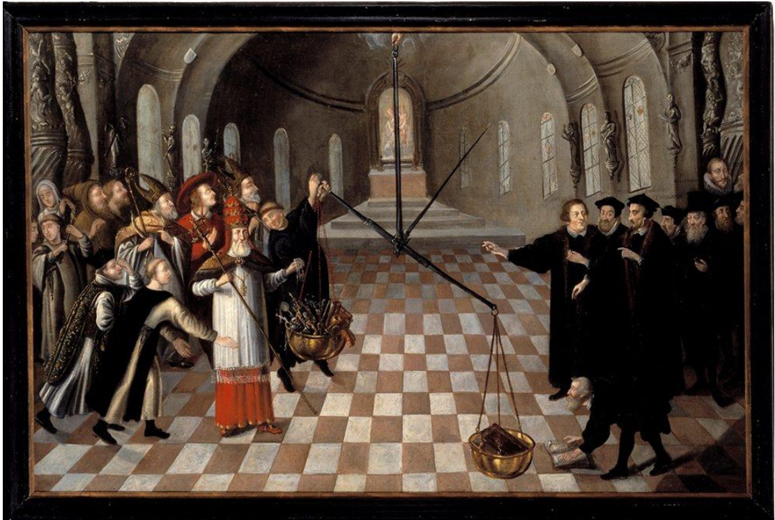
Anonymous. 'De Waagschaal van het ware Geloof', circa the first half of the seventeenth century. Beeld Museum Catharijneconvent, Utrecht.