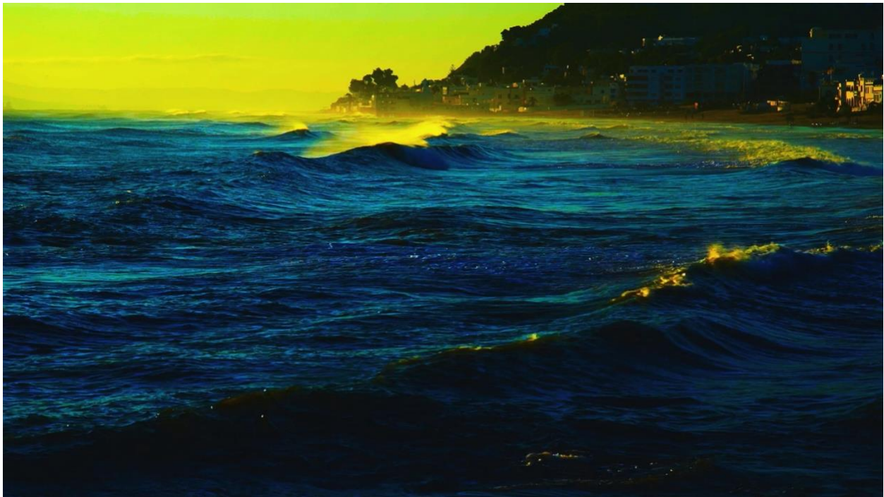
Figure 10: The Image Book : shot of the coast from La Marsa. Images from La Marsa are clearly set apart from others since they emphasise deep blues, bright yellows and reds, focusing on both the desert and the sea as borderless spaces. Casa Azul Films, 2018. Screenshot.

While in The Image Book we may be watching the hands of another filmmaker, it is Godard's voice that we hear reflecting: " Il y a cinq doigts et cinq sens, et cinq parties du monde. Oui les cinq doigts de la fée. Tous ensemble ils composent la main " ("There are five fingers, and five senses, five parts of the world. The fairy's five fingers. Together they make up the hand"). Accordingly, The Image Book is divided into five unequal sections—the largest one being called "La Région centrale" ("The Central Region") comes at the end, making up the film's second half. A pun on both the Middle East and Michael Snow's 1971 film by the same name, La Région centrale is cited at the beginning of "The Central Region", questioning our sense of perspective or grounding. Yet, unlike Snow, this does not comprise of a continuous image that seems to defy gravity. Rather, it is full of abrupt cuts, references to imperialist narratives and Western fantasies about the Arab world from Joseph Conrad's Under Western Eyes (1911), Alexander Dumas' L'Arabie heureuse (1860), and Cossery's Une ambition dans le désert that are juxtaposed to lines from Said and Spivak, and images from various films and moving images from the Arab-speaking world.