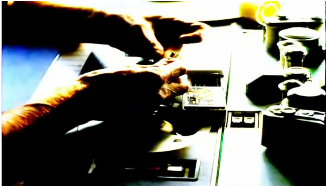
Figure 8: The Image Book . This is the third image we see in the film, one recycled from Godard’s King Lear (1987) that seems to picture Woody Allen’s hands. Casa Azul Films, 2018. Screenshot.