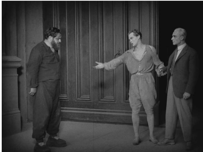
Figures 3 and 4: Unlike these images from the end of Fritz Lang's Metropolis , Godard's use of the hand is not meant to signify the working class. Rather, it is with the hand that the philosopher must think. Metropolis . Dir. Fritz Lang. Universum Film (UFA), 1927. Screenshots.

"Head and hands want to join together, but they don't have the heart to do it... Oh mediator, show them the way to each other..."