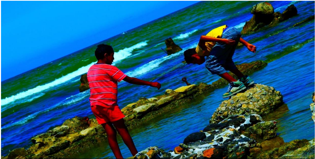
Figure 6: The Image Book : La Marsa. This image shot on location by Fabrice Aragno, Godard's director of photography, serves as a visual metaphor linking Godard's images to those of the nineteenth- and twentieth-century European Orientalists. Casa Azul Films, 2018. Screenshot.