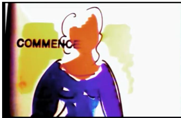
Figure 7: The Image Book . Godard inserts images from advertising to connect the discourse of Orientalism to that of global capital, particularly tourism. Casa Azul Films, 2018. Screenshot.