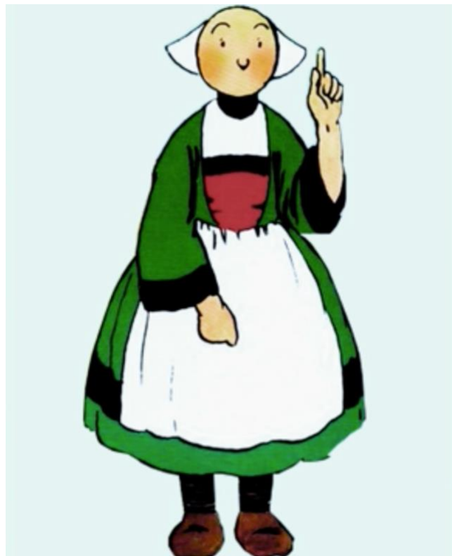
Figure 2: Bécassine in The Image Book . Figure extracted from the cover of the 1991 edition of Bécassine à Clocher les Bécasses , Gautier Langu, illustrator Joseph Porphyre-Pinchon. Although we do not see the figure of Bécassine until the second half of the film, she is the first reference Godard draws on in his voiceover.

The next shot interrupts this initial juxtaposition of image and text, by adding two more hands—the hands of a filmmaker or editor working at a Steenbeck editing table joining together spools of film and disentangling knotted strips of celluloid. The hands are presumed to be Woody