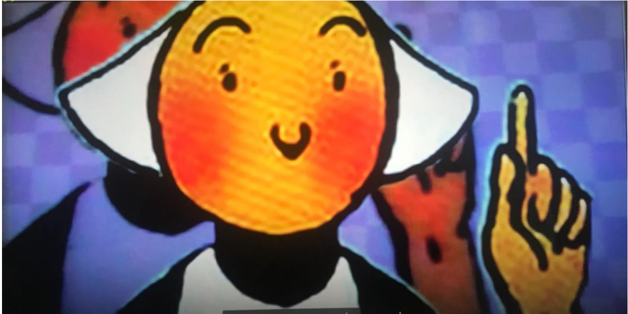
Figure 5: The Image Book : Bécassine, detail. This double image of Bécassine, now in close-up, appears toward the end of the film, signifying her multiple roles and relations to both rural or parochial France and to Orientalist fantasies about the other. Casa Azul Films, 2018. Screenshot.

Renaissance master painter, one who has come to be known as the epitome of classical, high art. Whereas Renaissance painting still features prominently as part of a Western dream of cultural dominance, Bécassine is the very definition of the local and parochial.