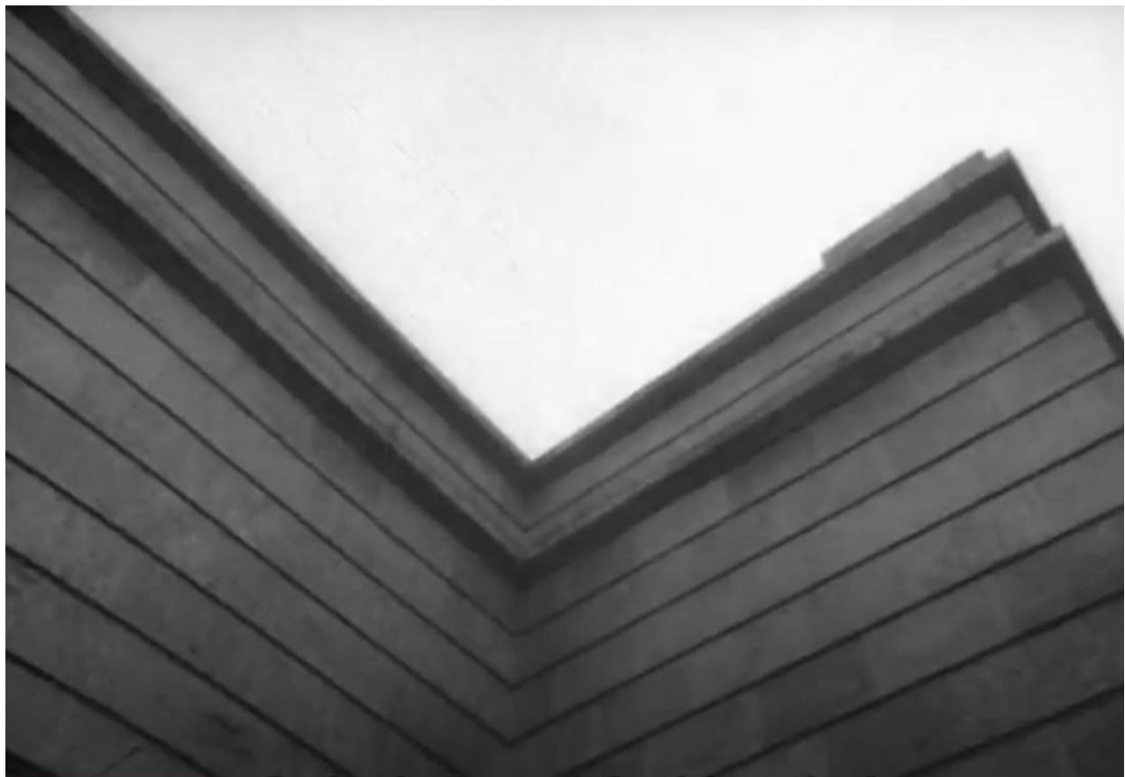
Figure 2: Fragmented architectural buildings. Brutality in Stone . Screenshot.