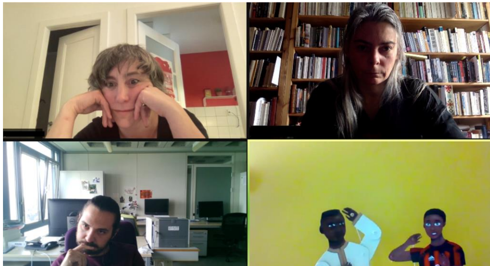
Figure 3: Screen capture of one session