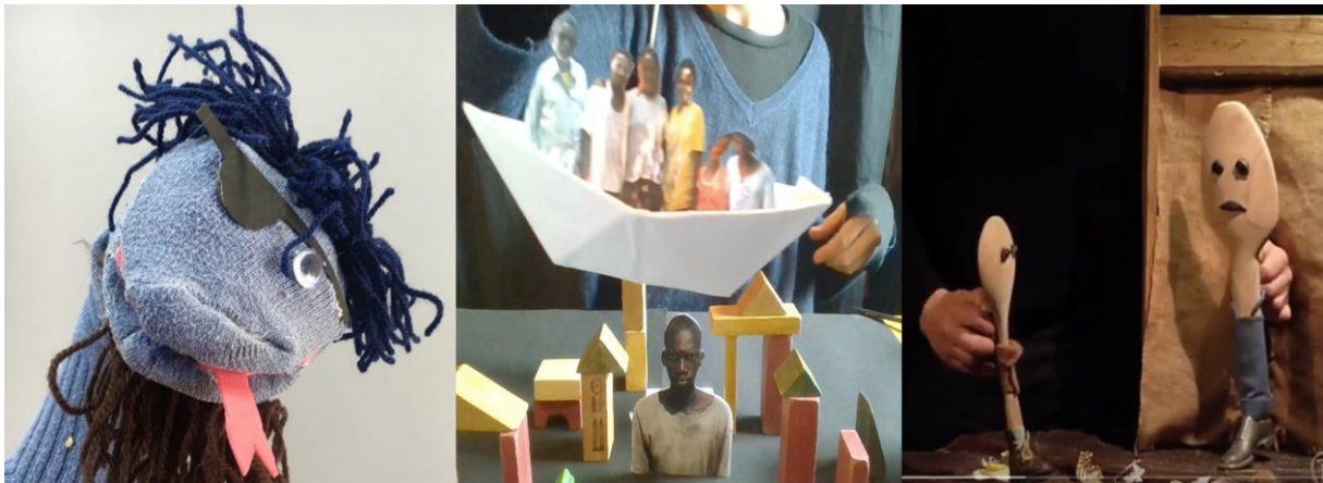
Figure 4: Socks puppets, image theatre and object theatre on the topic of migration.

After this preliminary exploration, we decided to keep three basic techniques for the course (see Figure 4): (a) socks puppets; (b) image theatre; and (c) object theatre. However, in their performance, the students mixed these technics.