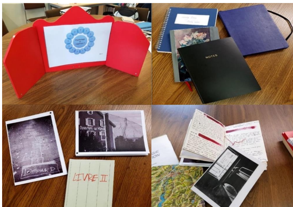
Figure 2: Different types of learning diaries

In this way, the diaries acquired a great diversity of presentations, such as electronic reports and handwritten notebooks, and frequently included non-textual and multimodal material including maps, drawings, pictures, cut-outs, music, and even a small Japanese-style wooden theatre (Figure 2). The function of the diaries was in all cases equivalent. These personal records of the content appropriation process gave an account, week after week, of the reflections, emotions and considerations that emerged. Hence, the diary represented a continuous process of reflection on their experience of the course (Kloetzer et al., 2020; Tau et al., 2021). These diaries provide first-person accounts of students' experiences of the course and allowed us to identify the U-shaped movement of reduction and expansion.