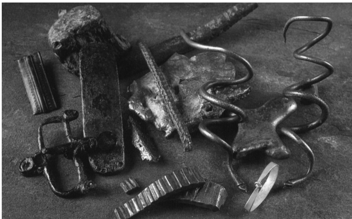
Fig. 3—Part of the assemblage of Insular metalwork and Viking Age silver and gold objects from the River Blackwater at Shanmullagh, Co. Armagh (courtesy of the Ulster Museum, Belfast).