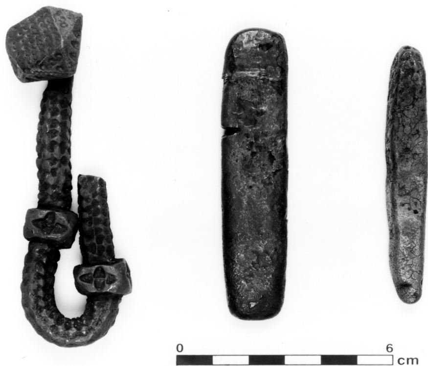
Fig. 7—The Loughcrew hoard, from a crannog on Lough Creeve, Co. Meath.