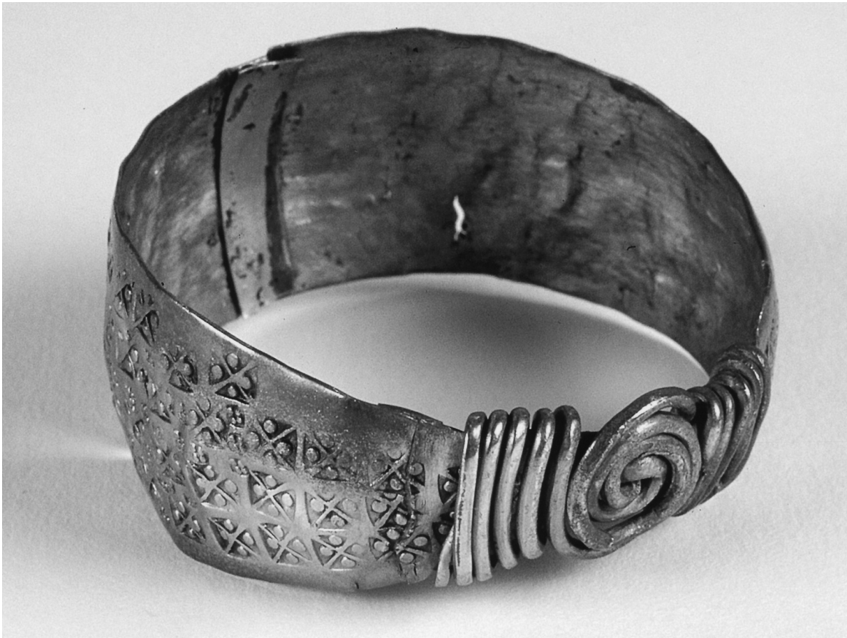
Fig. 2—Arm-ring from the River Liffey, probably Co. Dublin. Not to scale.