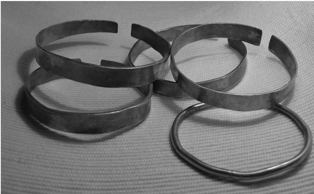
Fig. 4—Gold hoard from Vesnoy, Strokestown Demesne, Co. Roscommon. Not to scale.