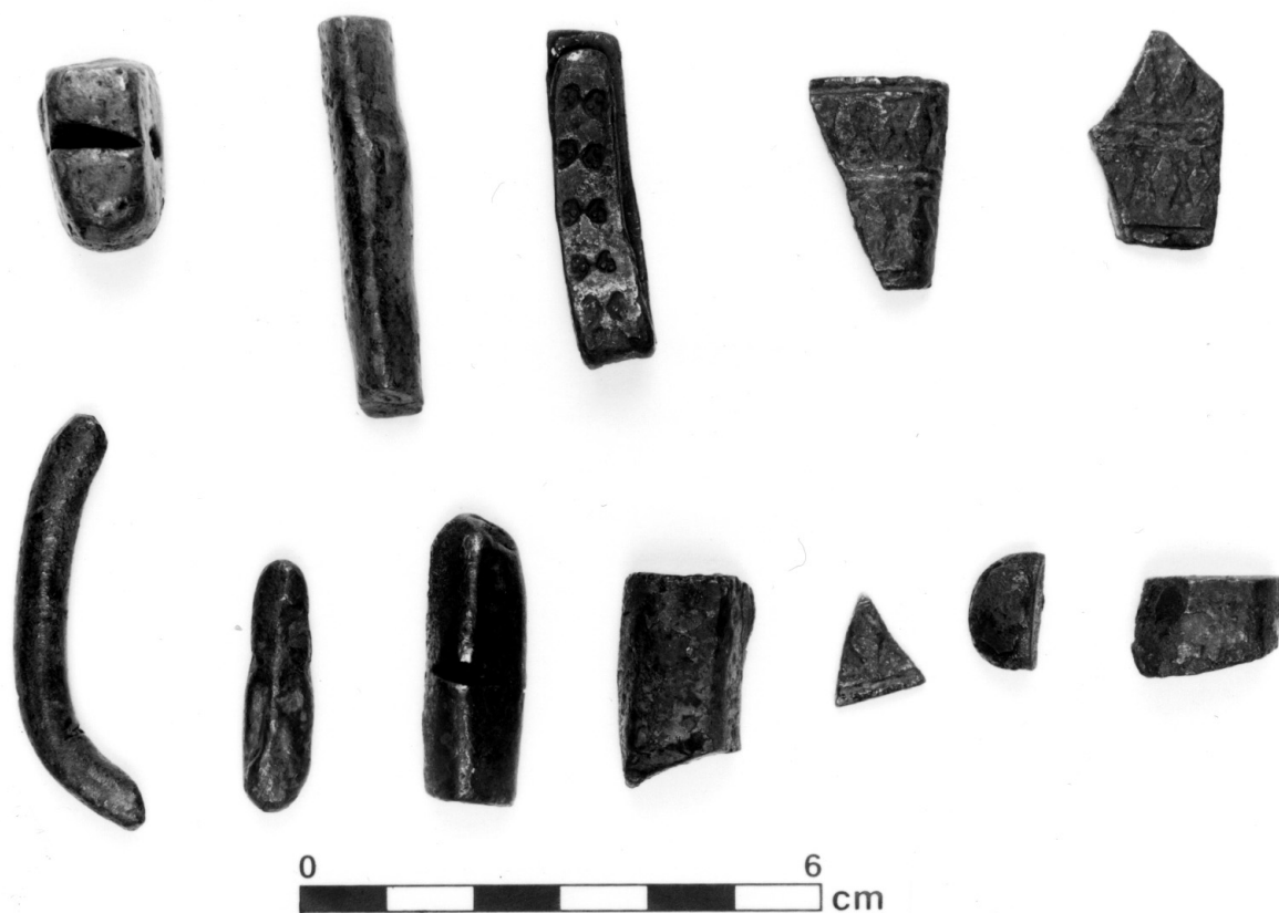
Fig. 8—The Rivory hoard, from a crannog on Lough Carrafin, Co. Cavan (courtesy of the National Museum of Ireland).