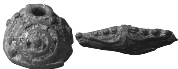
Fig. 5—Silver filigree-decorated bead fragments, Monaltyduff crannog, Co. Monaghan. Scale: x3.

Hencken 1950, 87, fig. 23, 81). There are, however, also two fragments of silver filigree-decorated beads, so far unique in Ireland, which were metal-detected from Monaltyduff crannog, Co. Monaghan (Fig. 5; Wood-Martin 1886, 195–6). It is all the more remarkable, therefore, that there are now ten recorded hoards from crannogs, the majority of which (seven in all) are from County Westmeath.