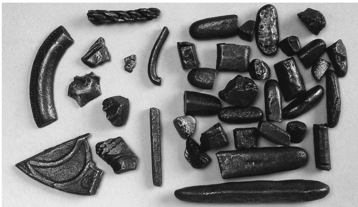
Fig. 6—The Ballywillan hoard, from a crannog on Lough Kinale, Co. Longford. Not to scale.

(Kelly 1994, 215). It consists of 38 objects (Fig. 6), with a total weight of almost 250g; most of these are in the form of ingots, comprising five complete examples and 23 highly fragmented pieces. The ten remaining items include hack-silver fragments derived from penannular brooches of both the bossed and ball types. The fragments of bossed brooch are of particular interest because they derive from an example that is clearly related to those that form subgroup F in Johansen's classification (1973, 105, 109–12; Graham-Campbell 1975, 45–6). These are considered to be of Hiberno-Scandinavian, rather than Irish, manufacture and—like the ball-type brooches—are of importance in testifying to contact and interaction between the Hiberno-Scandinavian and native Irish silver-working traditions. The Lough Kinale hoard is of typical 'Scandinavian character' and is most closely paralleled, in terms of its overall nature, with that from Ladestown (discussed above).