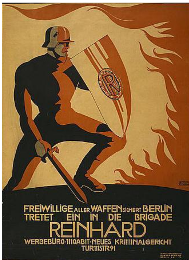
Fig. 1. Helmuth Stockmann, Freiwillige aller Waffen sichert Berlin; tretet ein in die Brigade Reinhard [Volunteers with all weapons will secure Berlin. Enlist in the Reinhard Brigade]. Lithograph, 94 x 71 cm. Berlin: Plakatkunstanstalt Dinse & Eckert 1919. Library of Congress, Prints & Photographs Division, WWI Posters, [reproduction number, e.g., [LC-USZC2-1234].