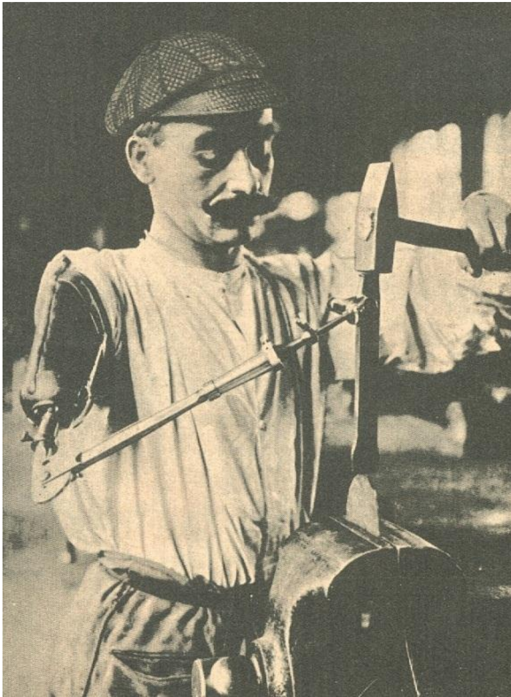
Fig. 4. Ernst Friedrich, "...and the war wounded proletarian at his daily sport", Krieg dem Kriege! [War against War], Frankfurt am Main, Zweitausendeins, 1980, 197.