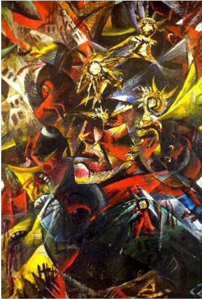
Fig. 2. Selbstbildnis als Mars [ Self-Portrait as Mars ], 1915. Oil on canvas, 81 x 66 cm. Haus der Heimat, Frielal. © Otto Dix/IVARO 2011.