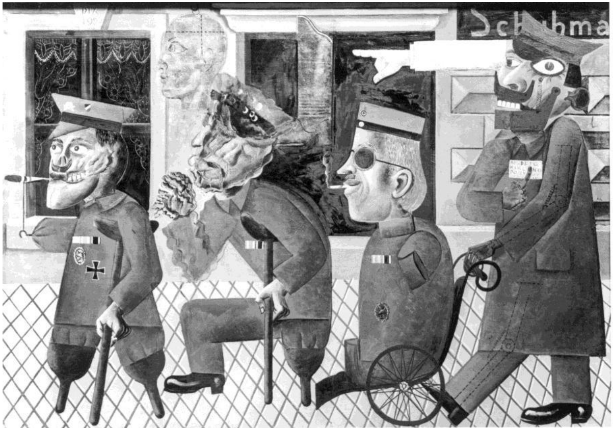
Fig. 3. War Cripples: A Self-Portrait (45% Fit for Service) , also subtitled Four of Them Don't Add Up to a Whole Man , 1920. Oil on canvas, 150 x 200 cm. Location unknown. © Otto Dix/IVARO 2011.