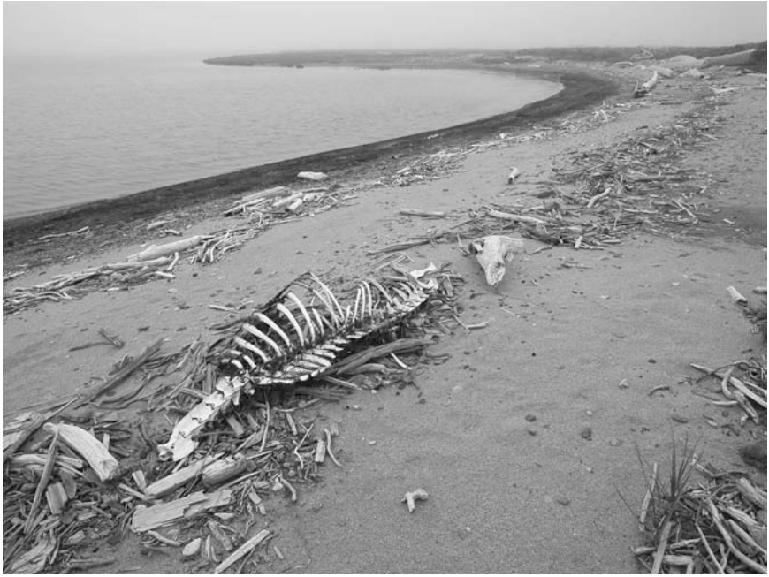
Figure 2: Subhankar Banerjee, Caribou Skeleton , Barter Island in the Arctic National Wildlife Refuge, 2006

conditions that mark the circulation, display, and reception of the photograph on the other.