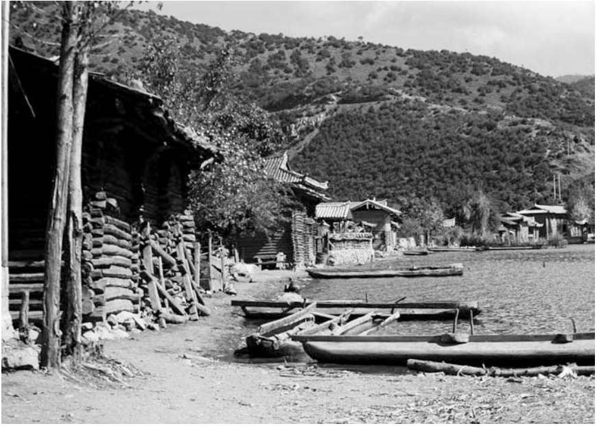
Figure 9: The entrance of Lige. Note that there is a garbage can in the center of the photo. October 2000.

and energy. Being located in the downstream or mid-stream of the global modernization “food chain” is the background of all problems in non-modernized or sub-modernized countries and areas.