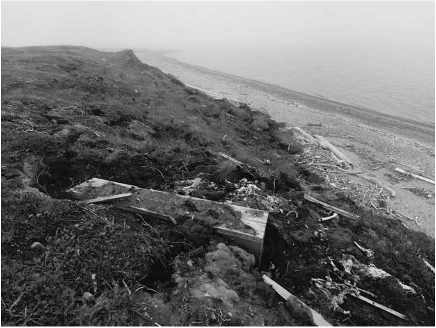
Figure 3: Subhankar Banerjee, Exposed Coffin , Barter Island in the Arctic National Wildlife Refuge, 2006

we confront today. In an exemplary analysis, Banerjee writes, “this photographic approach ... did as much to destroy the land as it did to preserve it.” First of all, such a fetishization of isolated sites of aesthetic beauty contributed to the intensification of touristic visitation of these very sites, thus contributing to the further disintegration of the putative purity that made them attractive to visitors in the first place. More urgently, however, the fetishistic isolation of such “natural sites” enforced an ideology of wilderness as a sacred zone of purity set over and against the realm of the human, thus implicitly marking such places as outside history, and other places as “unnatural” and thus unworthy of consideration in ecological terms. Echoing the environmental historian William Cronon, Banerjee suggests that this ideological framing of wilderness resulted in more than two decades worth of environmentalist campaigning devoted to the preservation of wilderness as an aesthetic amenity defined over and against the menace of “human intrusion” while ignoring the intensification of local, regional, national, and global ecological crises related to unsustain-