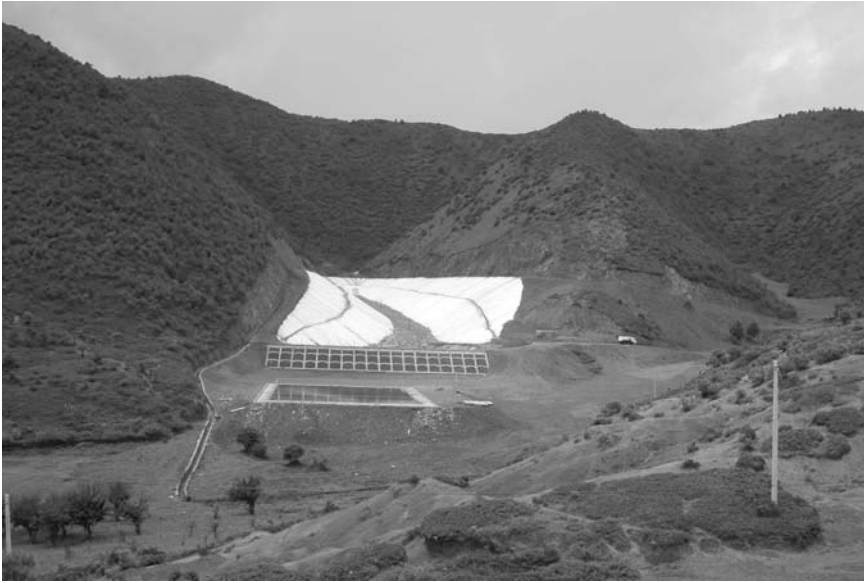
Figure 14: The garbage dump of Yongning in a mountain valley near Lake Lulu. Photographed on August 19, 2008

originally people's way of life. When these were made into the resources of tourism, people began singing and dancing for money, with the result that these activities became not life itself, but a performance of life. When people make money, they want to live in increasingly modern ways; they no longer live as before, but as people in modern areas far from the village. Their singing and dancing lose authenticity and become a staged performance. This means that the deepest resources they used for development are actually lost. This is a palpable shrinking at the "spiritual" level.