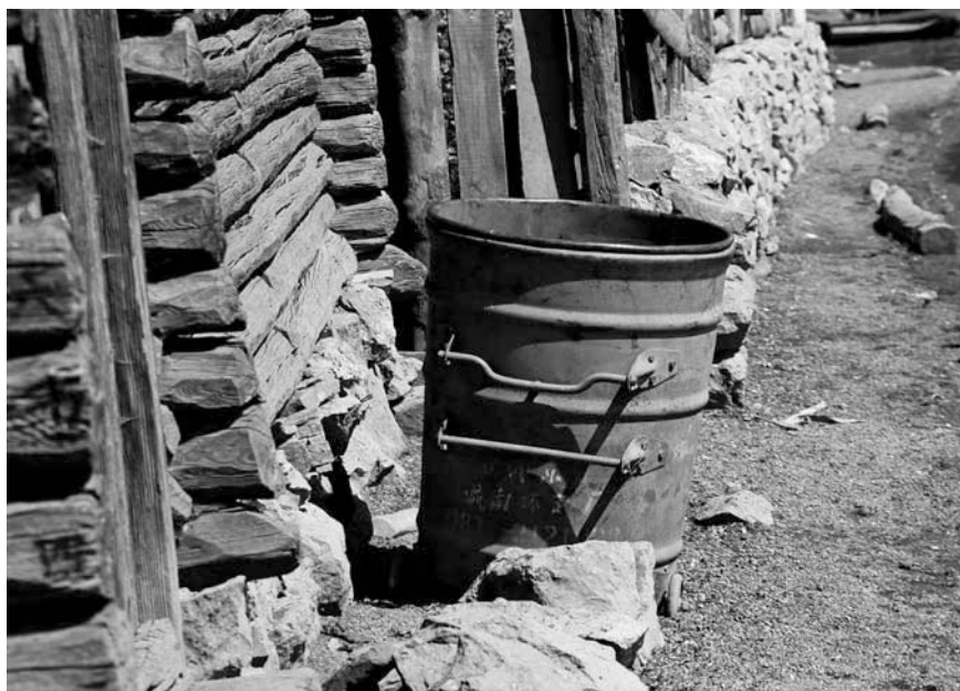
Figure 10: Garbage can at the center of the previous photo.

Lake Lugu. I asked her to find the places where Lige and Luoshui (落水) dump their garbage. Luoshui is another Nari village close to Lige. It is the first village there that developed tourism, and therefore is the richest village around Lake Lugu. It had Internet bars even before 2000.