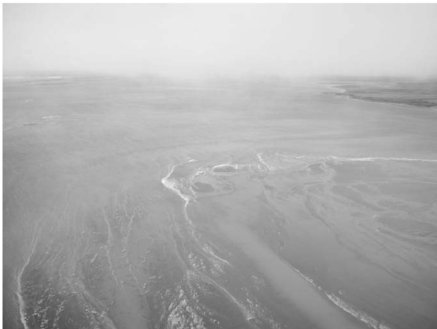
Figure 6: Subhankar Banerjee, Storm over Kasegaluk Lagoon, along the Chukchi Sea coast , 2006

the suspension of presence.” Nancy continues, “this suspension is always a question of passage, or a passing on. A landscape is always a landscape of time, and doubly so: it is a time of year (a season) and a time of day (morning, noon, or evening), as well as a kind of weather [ un temps ] rain or snow, sun or mist. In the presentation of this time ... the present of representation can do nothing other than render infinitely sensible the passing of time, the fleeting instability of what is shown” (Nancy, “Vestige” 94). Among other things, what is “shown” in its fleeting instability is depopulation itself, the voiding of human presence as the condition of landscape—a point echoed by Banerjee in his attention to the complicity of traditional landscape photography with a dialectic of colonial expansion and aesthetic preservation of “untrammelled wilderness.” Thus depopulated, landscape projects itself as a realm of purely natural temporality; but it is nevertheless frozen or suspended into a singular moment by artistic representation, arresting the very temporality to which it would bear witness in its claim to be devoid of human presence. The uncanniness of landscape identified by Nancy in the very origin of the genre—both its originary “depopulation” of the country and its paradox-