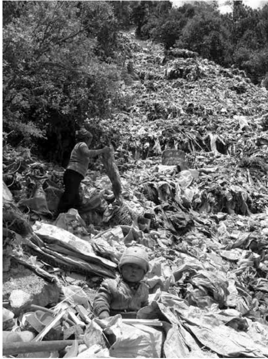
Figure 13: Garbage hill: six years of garbage from Luoshui village. Photographed by Zhao Hua, May 21, 2004.

nasty, and they always drank lake water directly. But in 2000, I was told in Luoshui that the water close to shore was not drinkable, and people had to draw a boat to the center of the lake to take drinkable water.