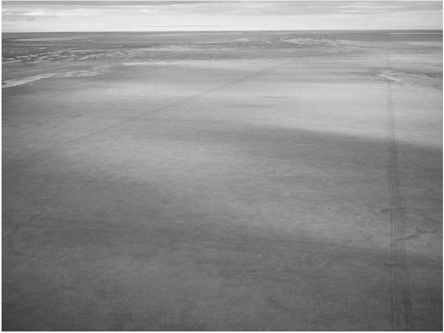
Figure 4: Subhankar Banerjee, Known and Unknown Tracks , Teshekpuk Lake Wetland, 2006