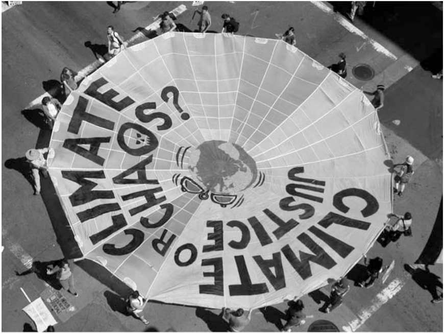
Figure 7: "Climate Justice or Chaos?"