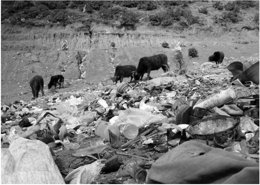
Figure 11: Garbage dumped by Liege Village.

made more and more money, and they began to use more and more industrial products in their daily lives, such as washing powder, shampoo, plastic shoes, etc., which are signs of civilization, development, progress, and so on. As a consequence, more and more non-biodegradable garbage appeared. The villages are at the bottom of “food chain”; they can’t find their own downstream for dumping their own garbage, and can only dump their garbage on their own mountain.