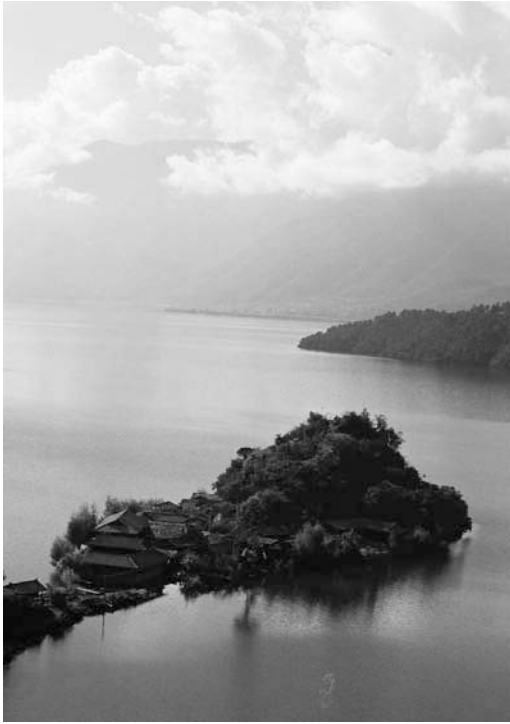
Figure 8: Lige peninsula in Lake Lugu, October, 2000.

corporations in North America, which produced cancer medicine. In this chain, all links made money. But the later the link in the chain, the more money it earned. The peasants stripping the yew gained the least money; and the medical corporations, the most. Which link, however, will bear the biological consequence of stripping yew? Of course, it is the local peasants, the lowest link of the “food chain.”