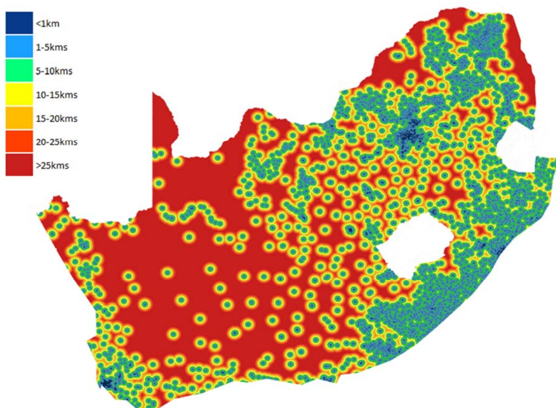
Figure 1: Distance to nearest healthcare facility