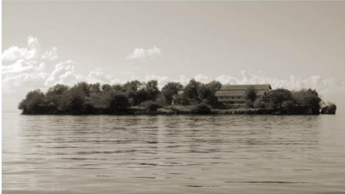
Figure 6: Nelson Island, Trinidad and Tobago.

and resentment at being thus mistreated, of being deprived of their newly found freedom and having just sent out new roots, being so abruptly and rudely uprooted once more. The stigma of being branded “enemy alien” was almost intolerable to us. (Stecher)