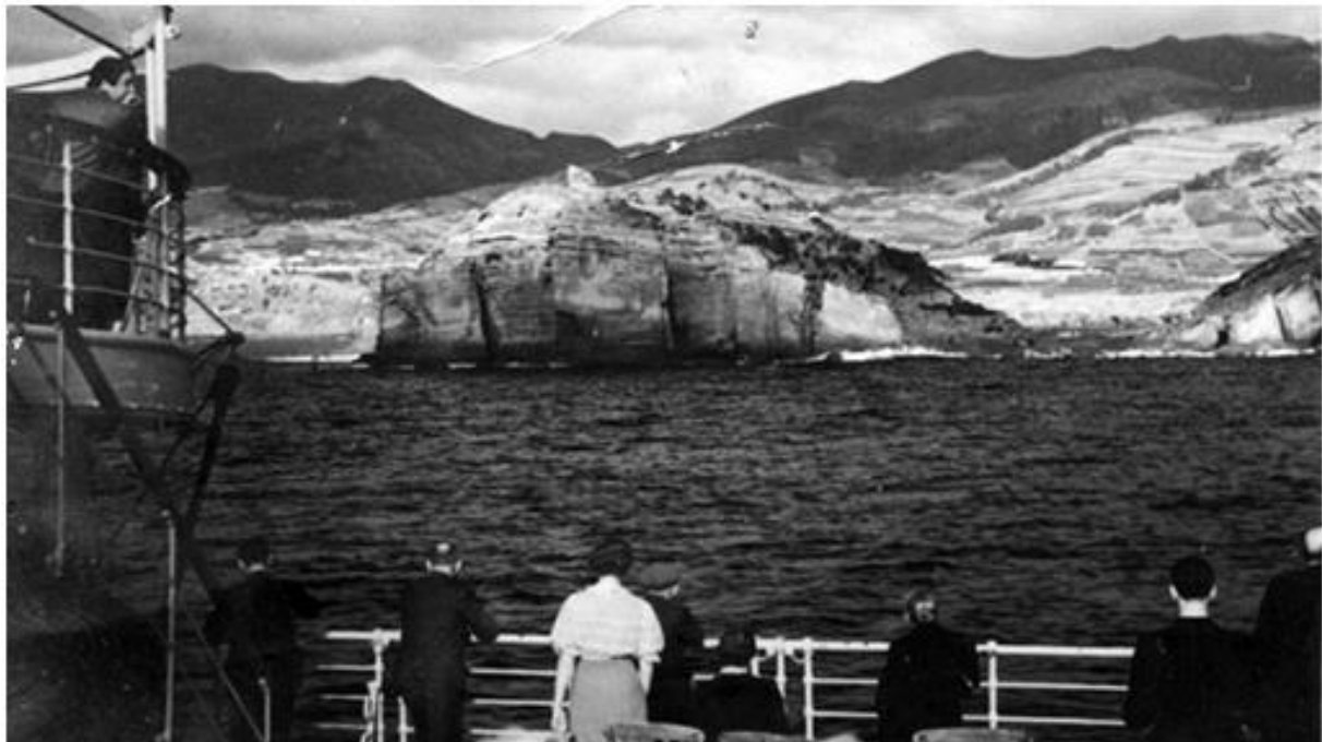
Figure 5: View from the MS Cordillera (1938). From The Last Goldfish . Screenshot.